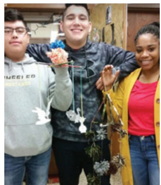
Wheeler's Child Development Class makes crib mobiles.