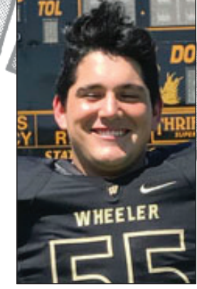
1st Team Defensive Lineman