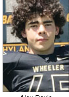
1st Team Offensive Lineman 2nd Team Defensive End