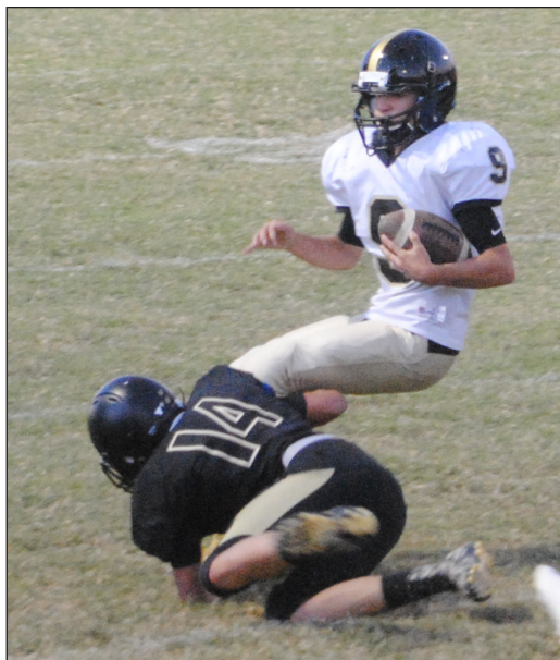
JV—#14 stops the ball carrier.