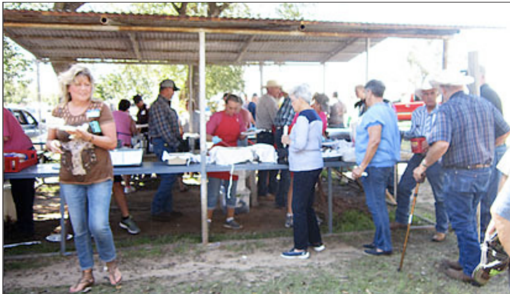
Three serving lines were set up to move the 427 individuals to receive their food as soon as possible.