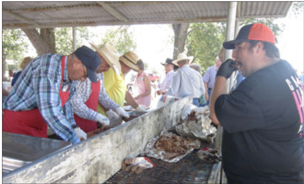
While the meat is being chopped in preparation for serving, This young man samples the barbecue to make sure it is suitable to eat.