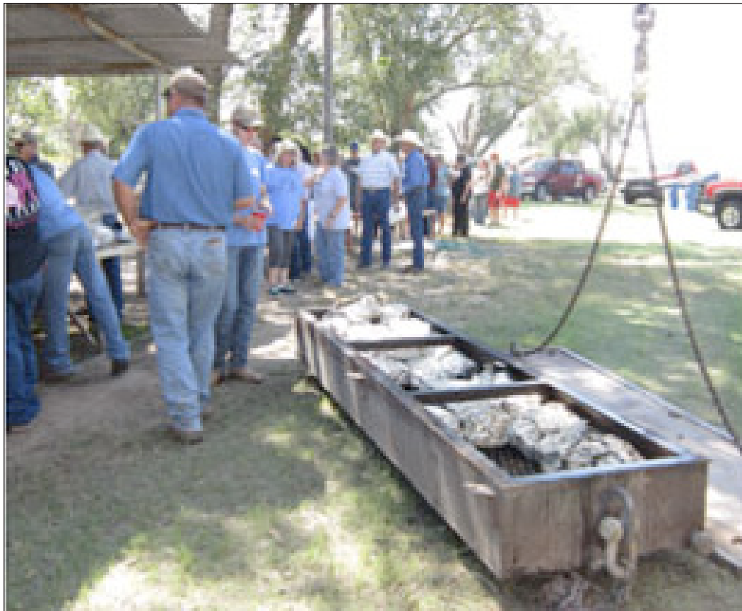
Cooked and awaiting final preparations, the barbecue is shown here removed from the fire with one line of individuals waiting to enjoy.