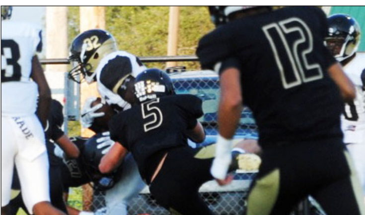
3-5-12 Defense stopping the Cyclones at the end zone