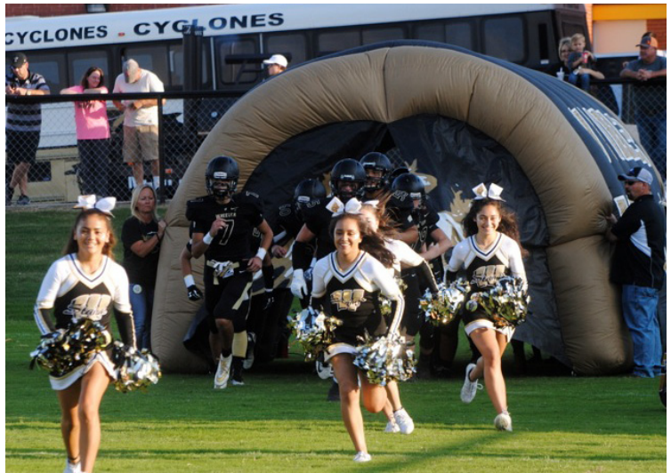
Cheerleaders lead Mustangs onto the field.