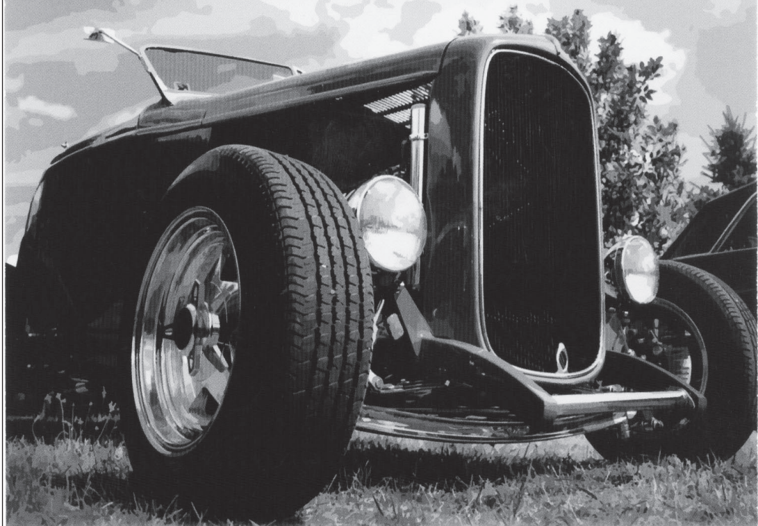
MAIN STREET SQUARE WHEELER, TEXAS