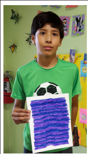
A Wheeler Library Summer Reading Attendee.

Sunday Nite Live KPDR-FM, 90.3 ... Live from Canadian 9:00 p.m. to 11:00 p.m.