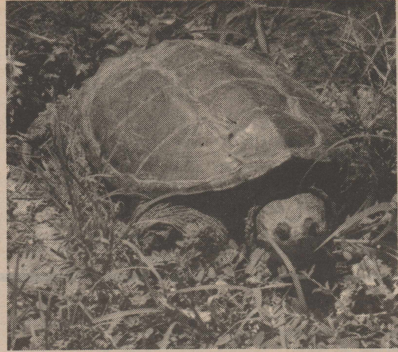
HERMAN FRANCIS STALLONE