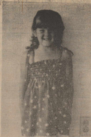
CAMI KA COMER