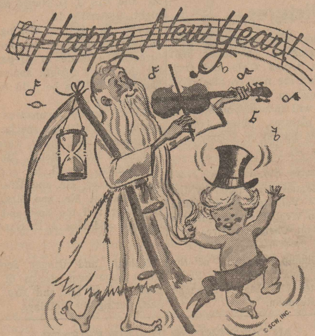
Singing out the old and dancing in the new, to a melody of good wishes