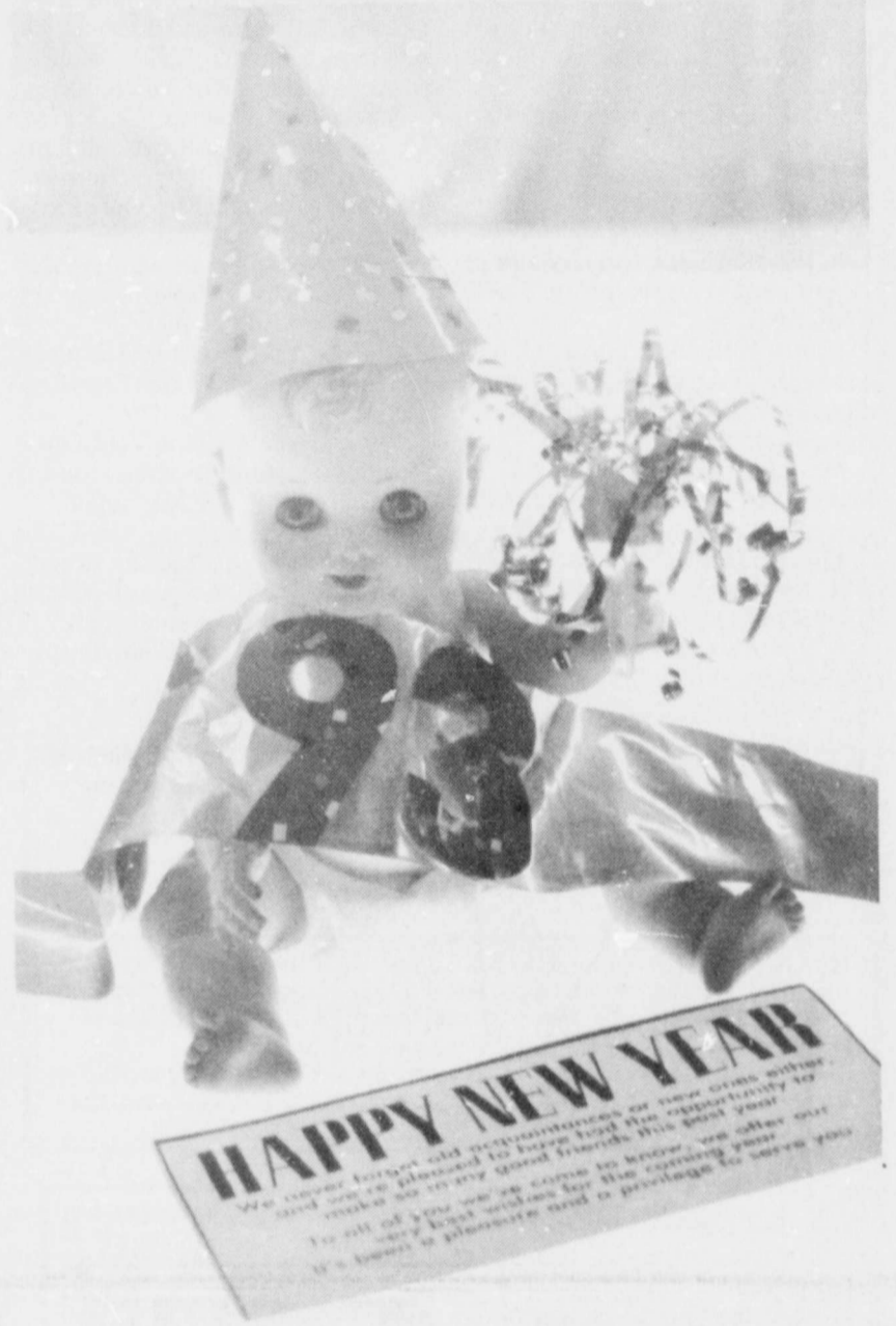
BABY NEW YEAR! 1993 read the banner across this "baby New Year" as the old year is

tage of all the modern features it provides.