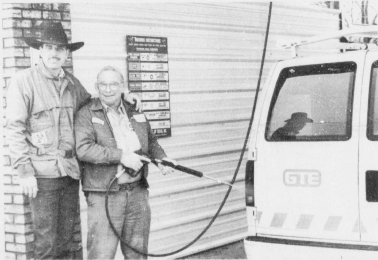
THE REBEL CAR WASH is newly opened for business on Main Street in Bogata. Proprie-

Yes, 1992 went by in a hurry. As always there were joys, there were sorrows. From all of us we wish each and every one of you a HAPPY NEW YEAR in 1993.