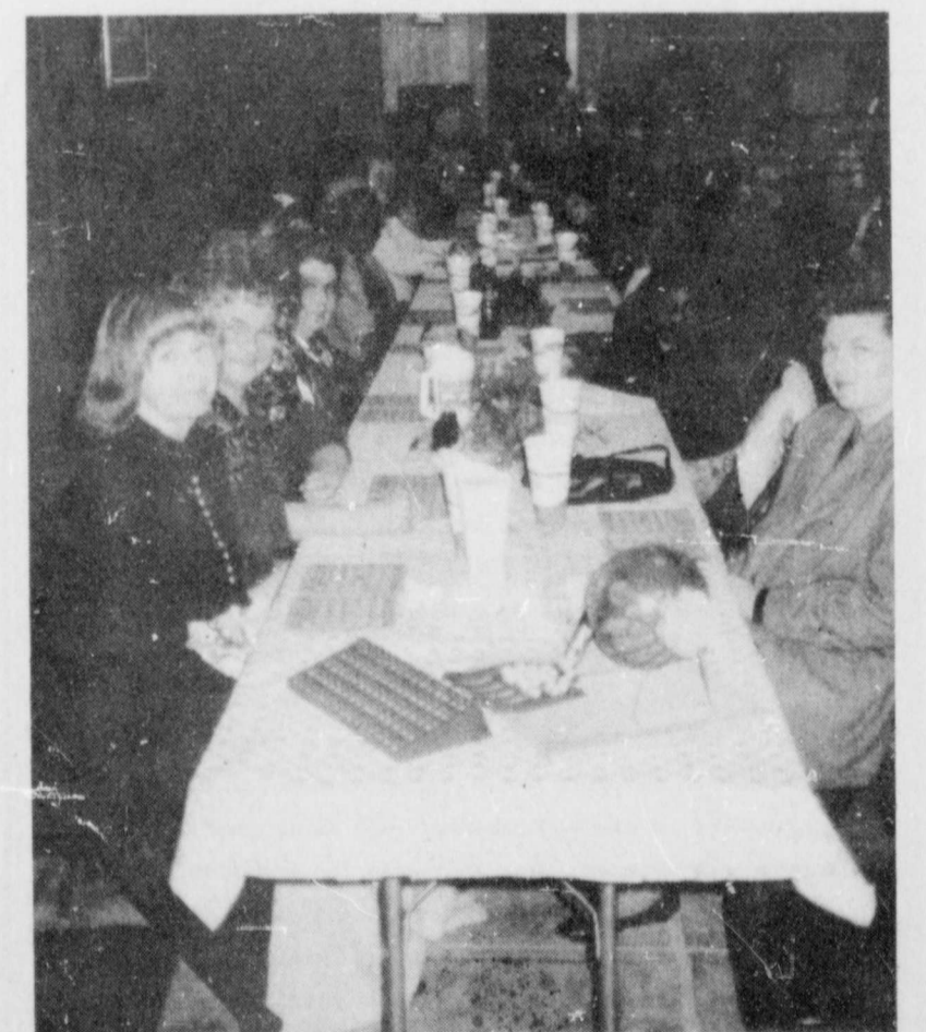
THE ANNUAL Christmas Party for the Clarksville, Talco Bagwell, and Detroit Post offices for QWL/EI was held at the Detroit Community Center during December. Employees and their families mentioned post offices and special guests

In Titus County, Talco received a check for $1,253.31, an increase over last year's $846.38. 1992 payments to date are $17,141.31, a decrease from 1991's $20,210.36.