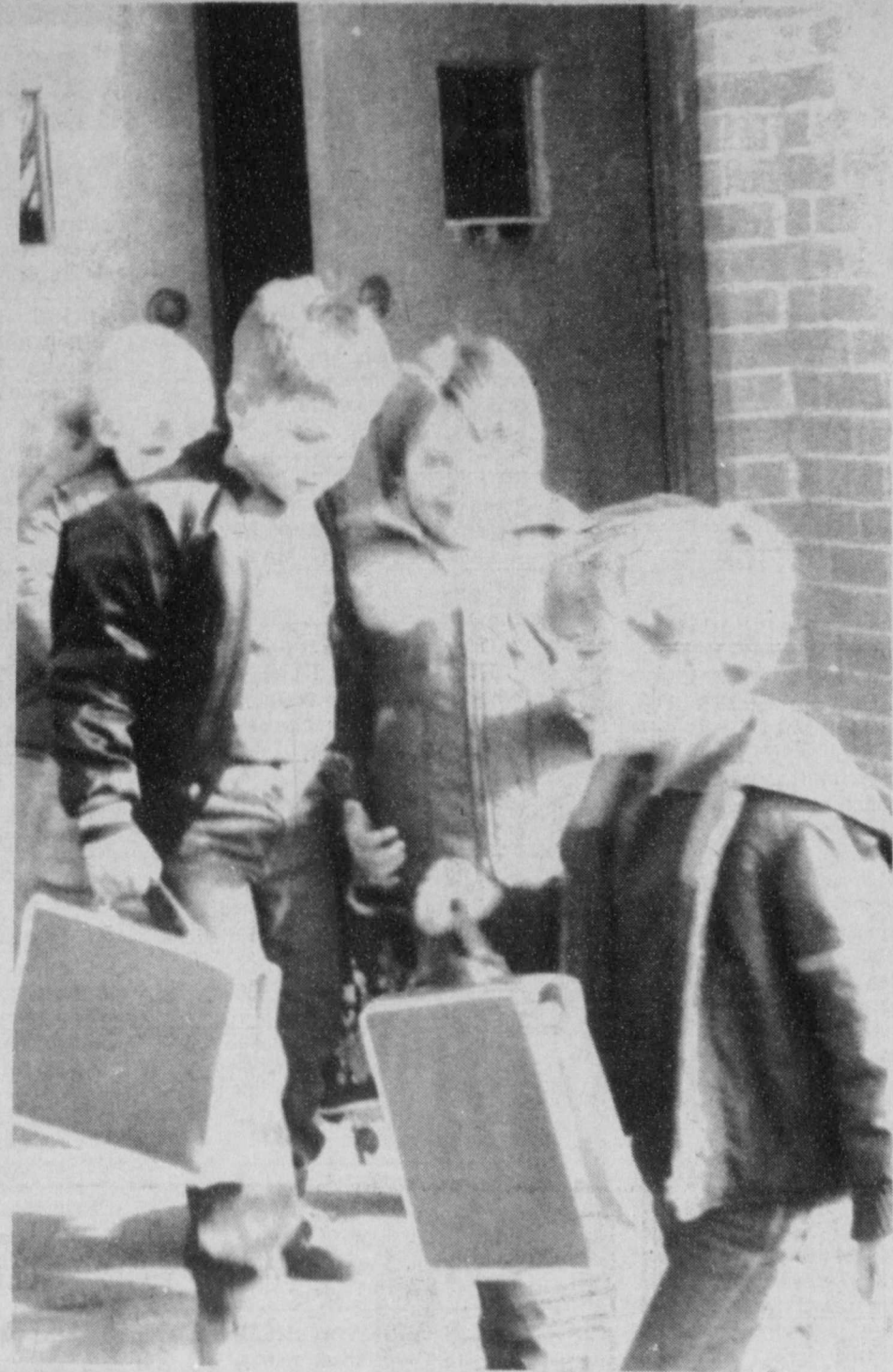
SCHOOL IS OPEN AGAIN! Children in the Talco-Bogata school system went back to school this week after the holidays. They seemed excited to be back.