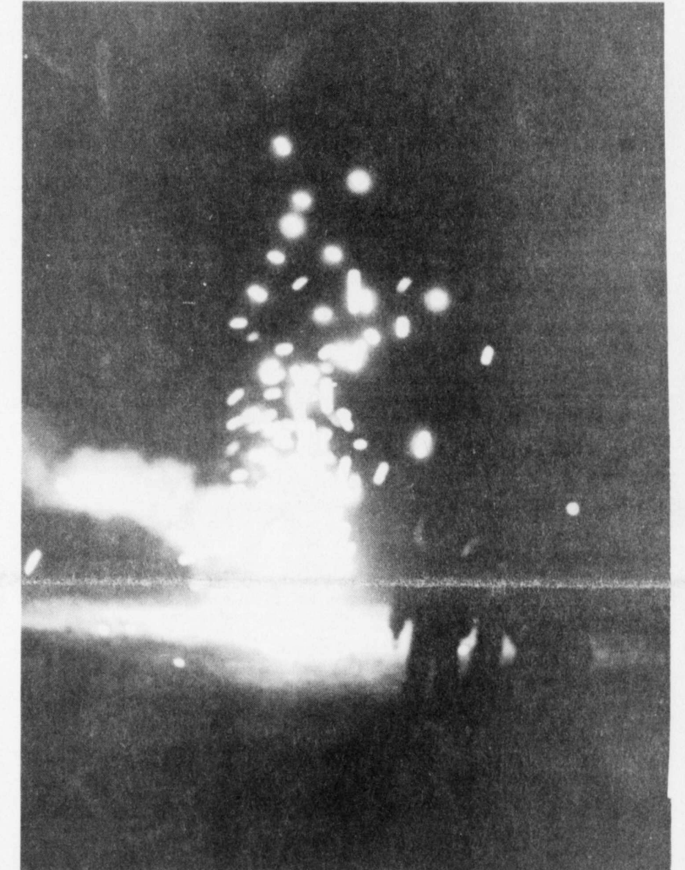
FIREWORKS were part of most youngsters New Year's Eve. The younger ones thrilled to fountains, rockets and strings of firecrackers that lit the cold, dark night up throughout the area. (Staff Photo)