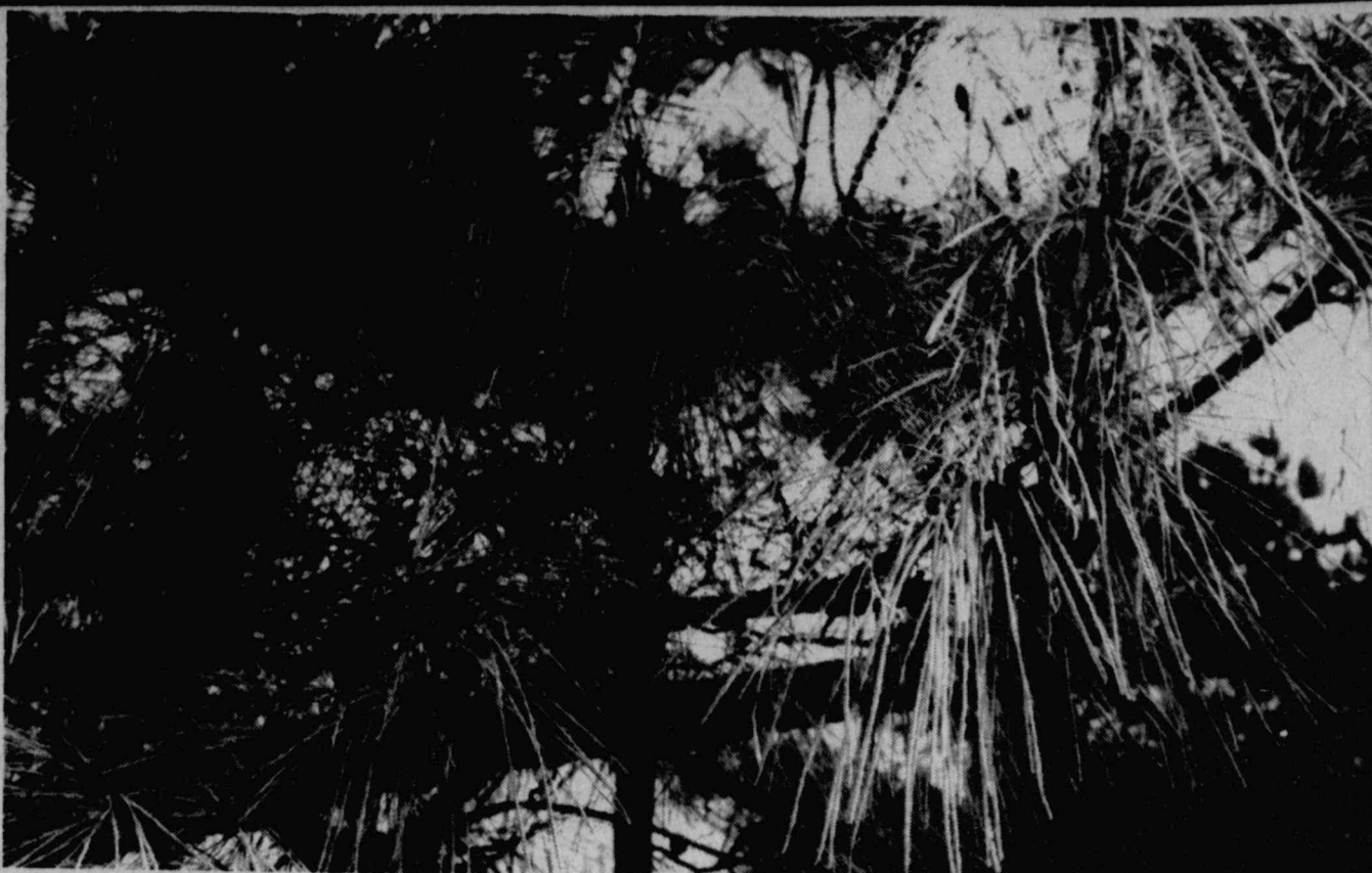
WEATHER —Frozen phenomenon—Frozen fog, which settled in a heavy, frost-like cover over trees, bushes and roof tops, covered the area Tuesday morning. The frost was so heavy that it looked like a light snow, and turned the world quite lovely for most of the day. The weather cleared and the sun came out in the afternoon.

Employ thy time well if thou meanest to gain leisure. —Benjamin Franklin