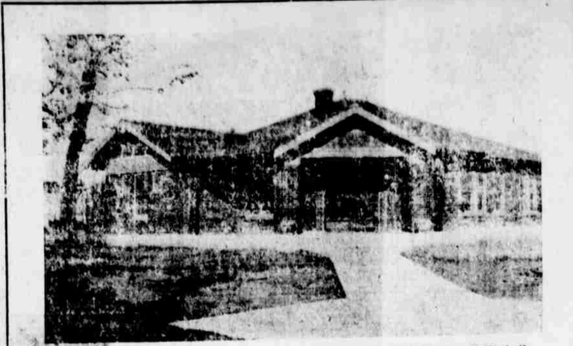
Haskell Public Library, Erected and Maintained by the Club Women of Haskell

The president gives "inefficiency" as his reason for firing a large number of employes in the bureau of engraving, but unless he becomes more specific in his charges the public is going to think it was politics instead.