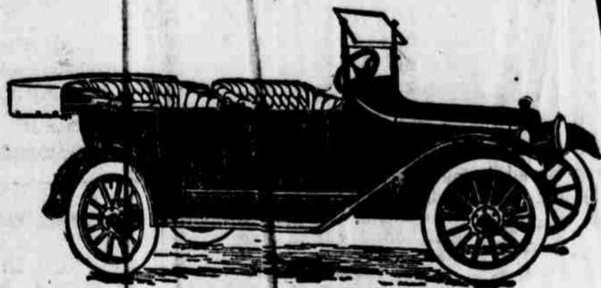
Model "Four Ninety" $595 F. O. B. Haskell.

Equipped with Electric Starter and Lighter