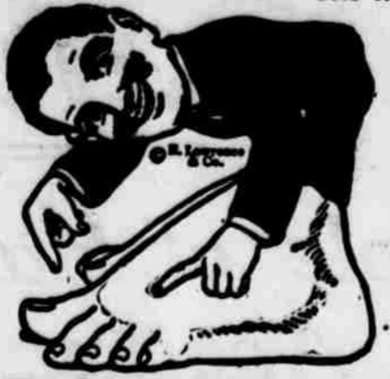
These Corns Come Right Off, Clean As a Whistle, by Using "Gets-It!"

What's the use of sporting a good time for yourself by limping around with those corns? It's one of the most simple, easy "Gets-It" does it