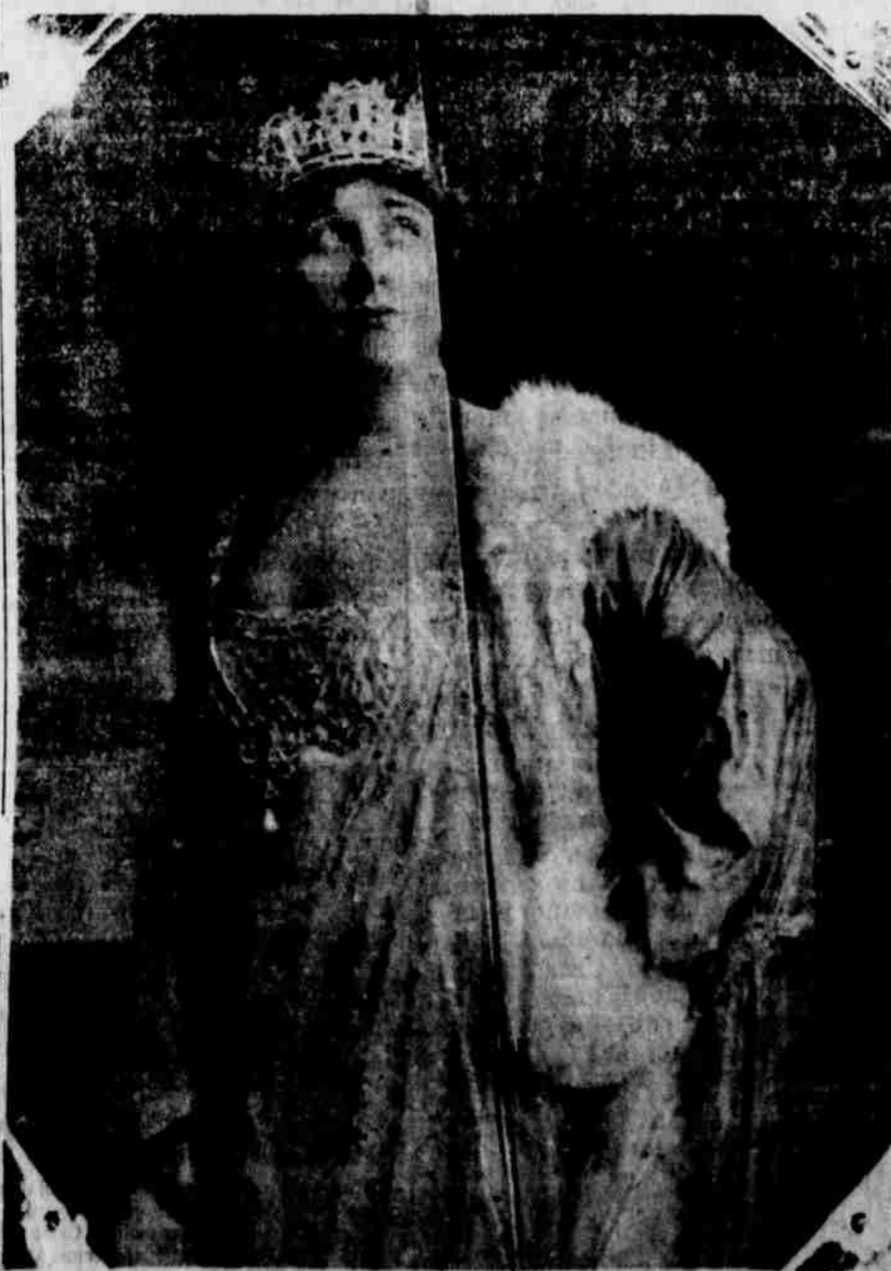
Geraldine Farrar Appearing in "Carmen" at Dick's Theatre Saturday, Jan. 1st.