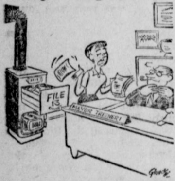
...and here's one signed "irate taxpayer."