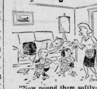
"Now pound them softly—your daddy wants to nap."