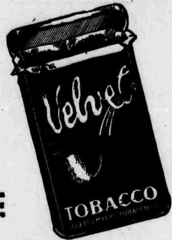
The Velvet tin is twice as big as shown here

I F ever men are "Tom" and "Bill" to each other, it's when good pipes are a-going. If ever good pipes go their best, 'tis when Velvet's in the bowl.