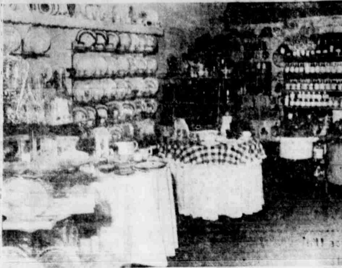
ASSINGS JEWELRY was one of four Haskell merchants who designed display tables for the tour of District 4-H mothers, during the District 4-H Food Show held in Haskell recently.