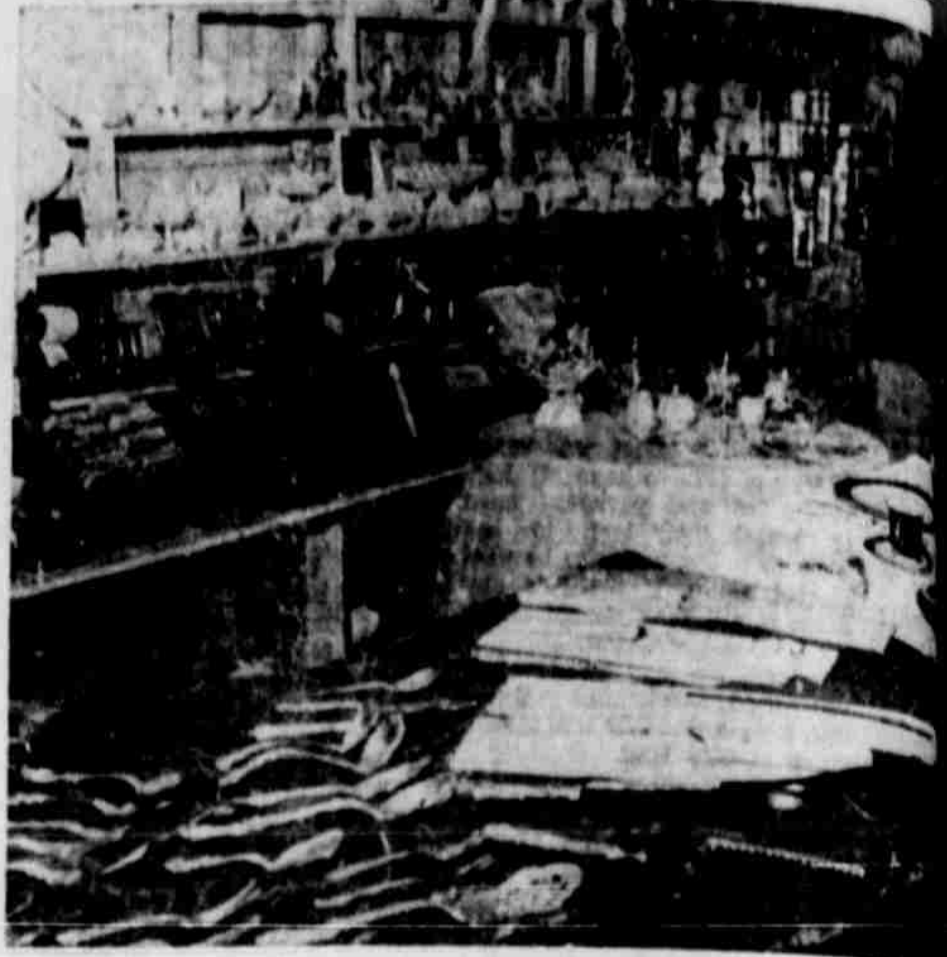
LYLES JEWELRY was one of four Haskell merchants who designed display gift tables for the tour of District 4-H mothers, during the recent District 4-H Food Show held here.

In addition to the massive mail-out next Tuesday, several other events will take place during the campaign. Talent shows to raise funds for the campaign have already been held in Rotan and Moran.