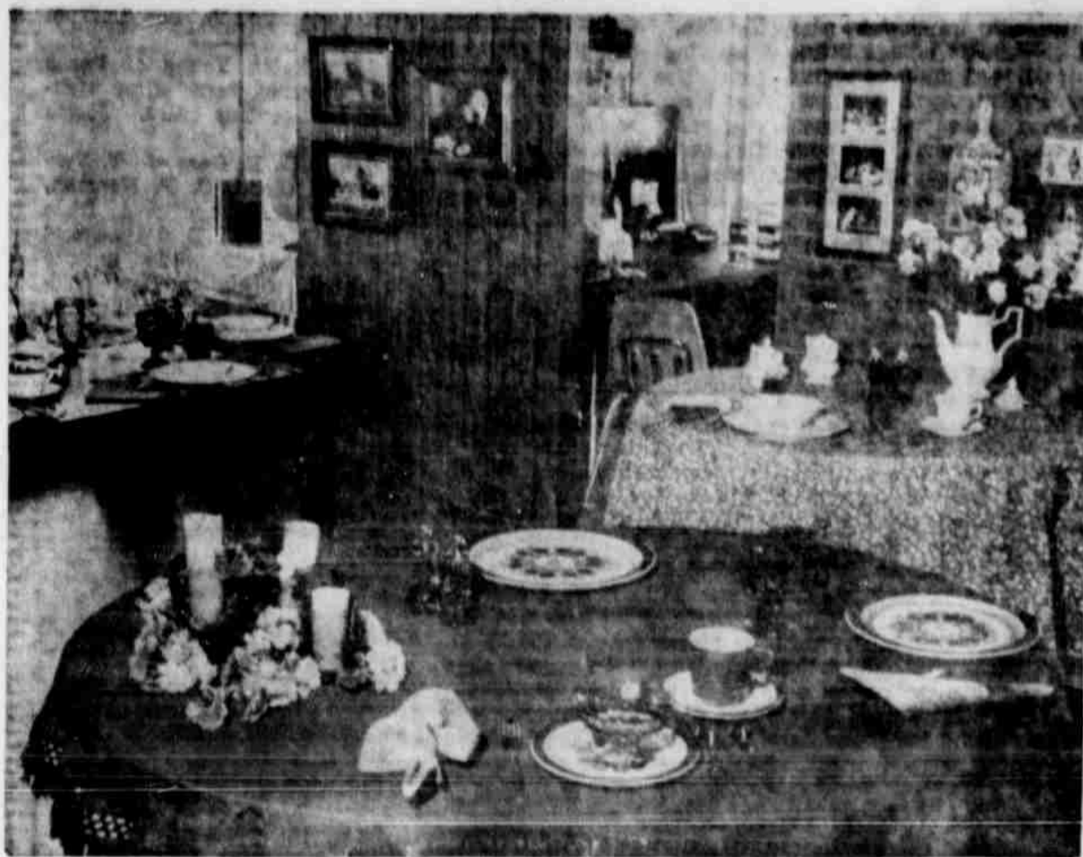
BYNUM'S FURNITURE was one of four Haskell merchants who designed display gift tables for the tour of District 4-H mothers, during the recent District 4-H Food Show held here.