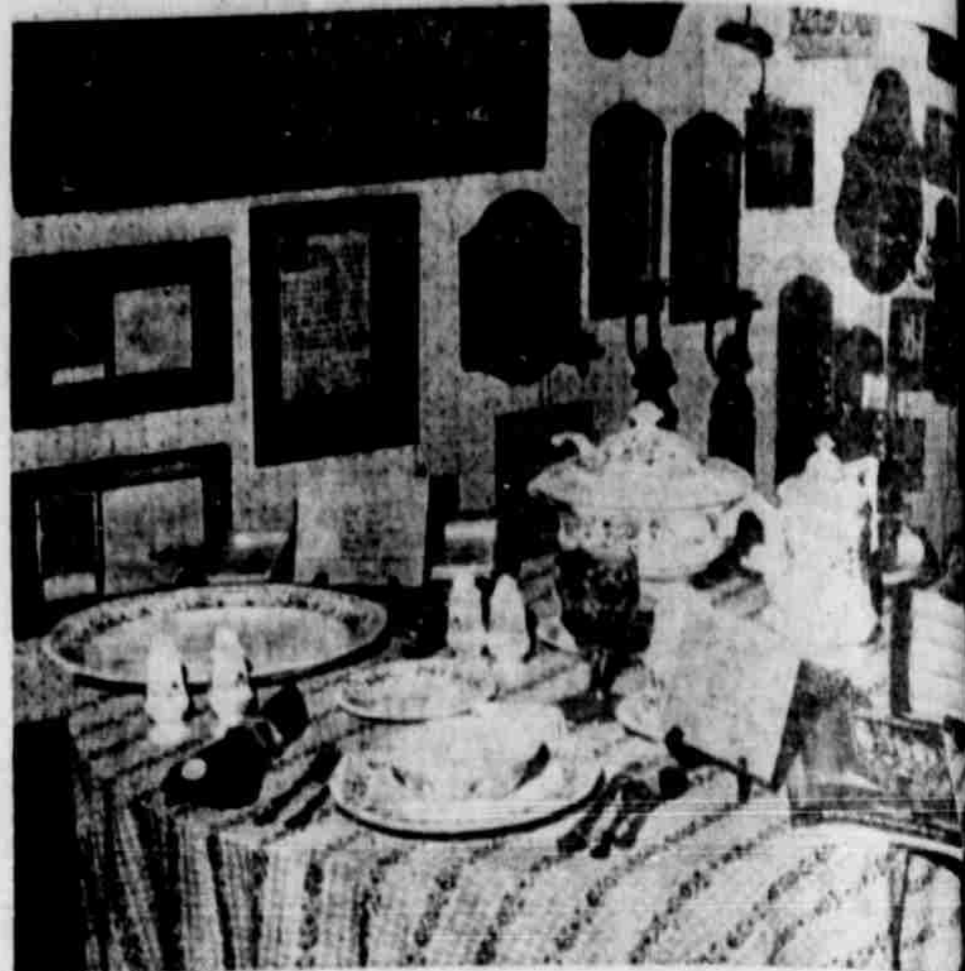
JONES COX COUNTRY STORE was one of four Haskell merchants who designed display tables for the tour of District 4-H mothers, during the recent District 4-H Food Show.

Johnson Pharmacy —Your Prescription Center— HASKELL, TEXAS