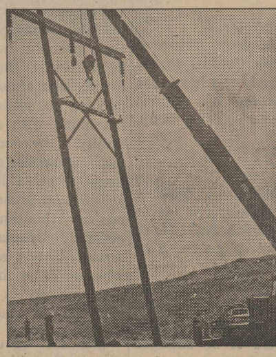
"We're putting in a new 115,000 volt line . . . gives us another feed to back up our dependability . . .