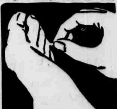
The Only Peels-Off Way is "Gets-It."

It is just when a corn hurts that you want to feel sure about getting rid of it. Why take chances of keeping the corn and having the pain grow worse? You'll use "Gets-It."