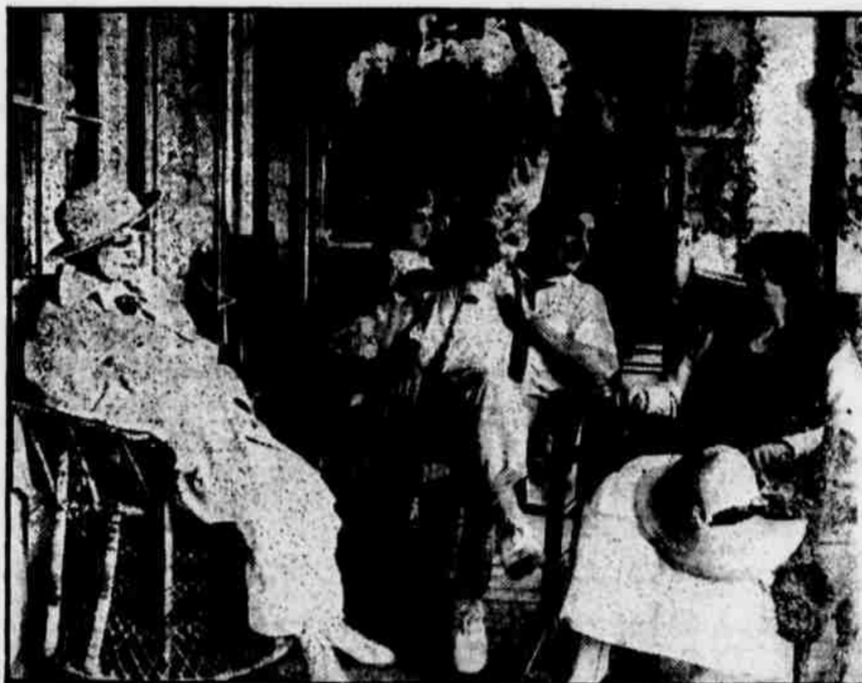
Scene from "A Fool There Was" at Dick's Theatre, Saturday Night