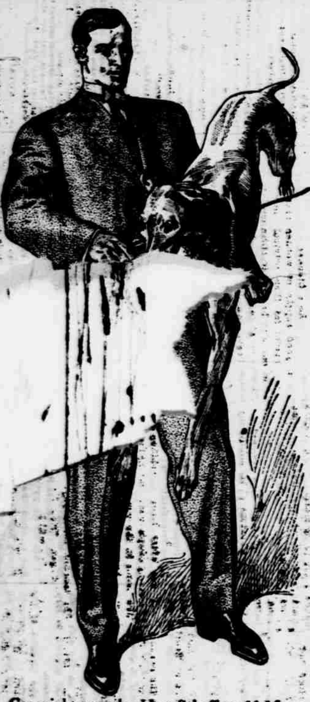
Copyright 1907 by Hart Schaffner & Marx

We carry a special line of these and you will find none better at any price, therefore this offers an unusual opportunity to fit your children up with shoes for the winter.