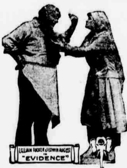
SCENE FROM COMING ATTRACTION AT DICK'S THEATRE

See or write me before buying C. JONES, Haskell, Texas