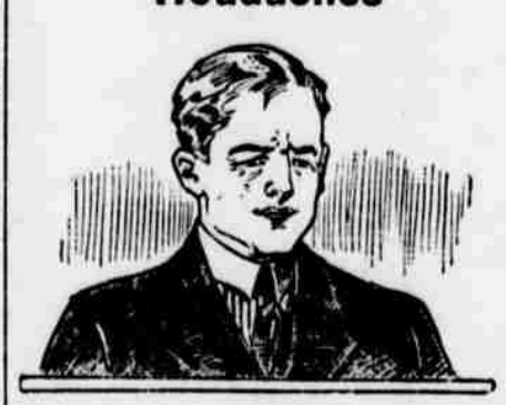
Squinting Is Not a Habit