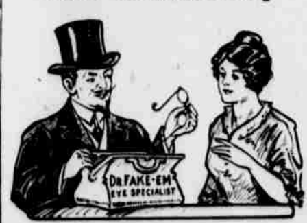
Beware of "Grab-Bag" Glasses

sold by "eye-specialists" who are here today and gone tomorrow. Their wares are likely to prove quite as unreliable as their business methods.