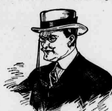
Eyeglasses That Reflect Your Individuality