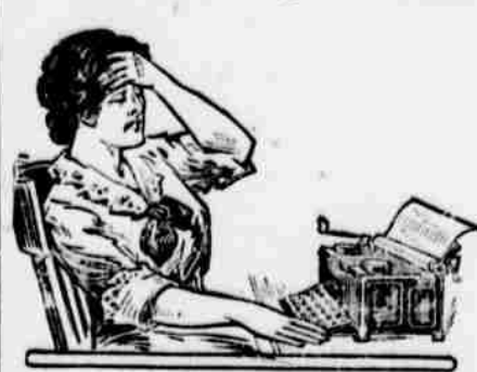
Those Late-in-the Day Headaches