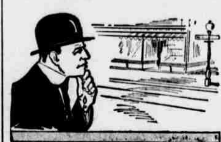
Do You See Distinctly?