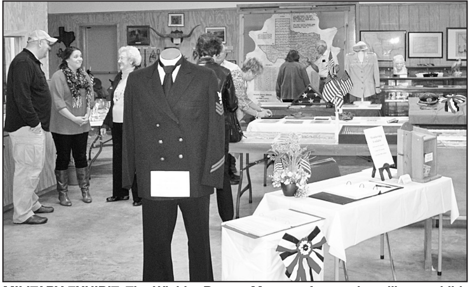
MILITARY EXHIBIT-The Wichita Brazos Museum featured a military exhibit during the Knox County Veterans Day celebration.