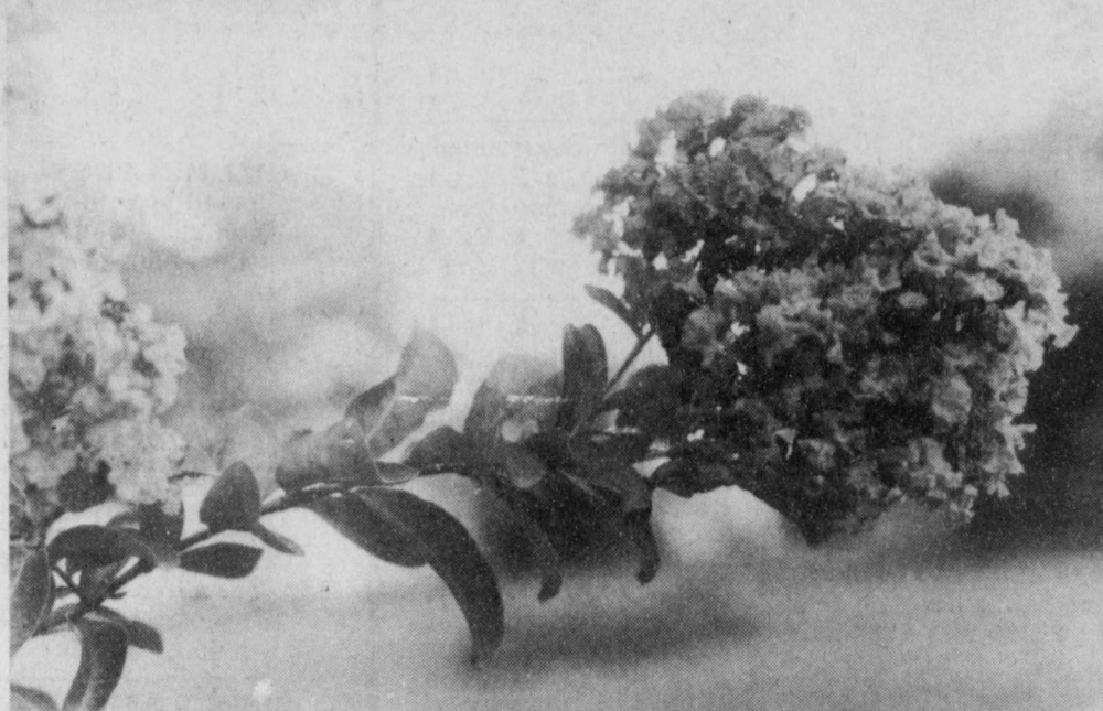
SUMMER COLOR— Crape Myrtle, hardy throughout East Texas, provides some of the finest color displays around with its bright pinks to pale lavender shades. The plant blooms during the hottest part of the summer and grows into large bushes.