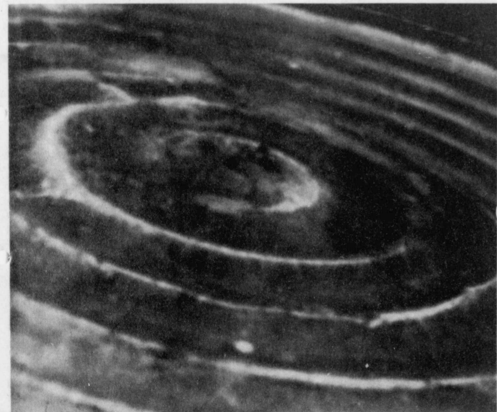
GUESS WHAT—a five dollar bill goes to the first subscriber to the paper that correctly identifies this common household object. (Staff Photo)