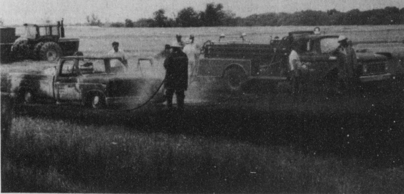
DESTROYED —This 1980 Ford pickup was completely destroyed when it caught fire. The pickup was parked on wheat stubble which the owner, Paul Withers, was combining. It is speculated that the catalytic converter on the vehicle set the stubble on fire, which in turn ignited the gas tank of the pickup.