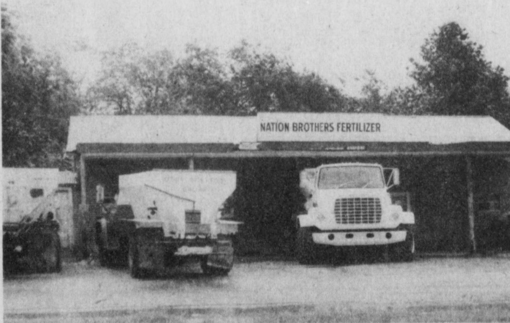
NATION BROTHERS Fertilizer in Blossom can provide fertilizer to fit individual needs, from the smallest to the largest farmer. They can deliver, or spread it themselves, or whatever suits the customer.