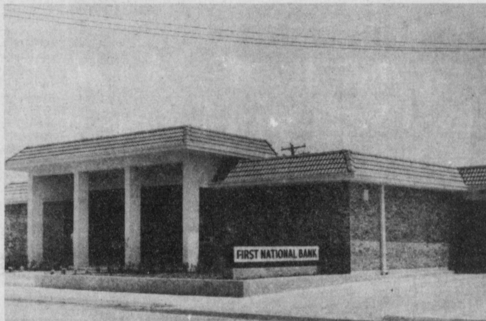
FIRST NATIONAL Bank of Deport offers traditional courtesy, excellent service and the newest in modern facilities for all their customers. They invite old friends and new to drop by, or take advantage of the drive in window facilities.

WOW! What A Way To Shop! No Gasoline Bills, No Parking Problems, No Rip-Offs, Just GOOD SERVICE and GOOD QUALITY At Your HOMETOWN STORES!!