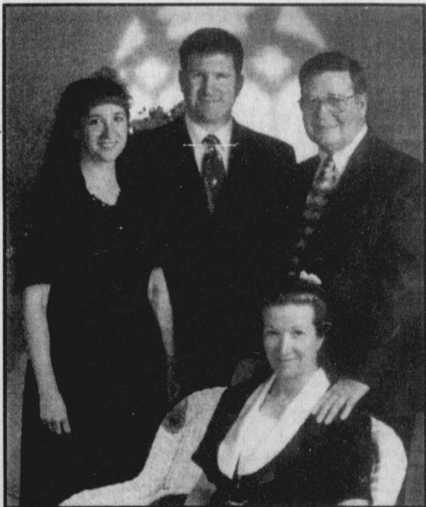
Cunningham Baptist Church will host a singing on April 2nd at 6:00 that evening. Please come and join us as we enjoy the special music of the "Gospel Chimes".