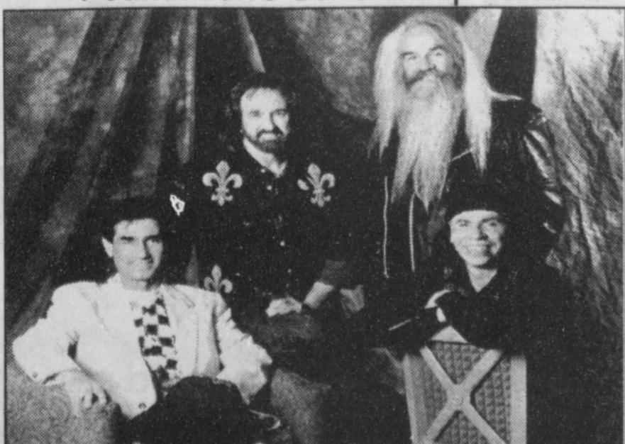
The Oak Ridge Boys, Featuring Area Native Duane Allen

All Proceeds Benefit the Prairiland Academic Trust Foundation's Scholarship Fund