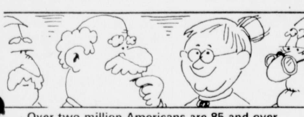
Over two million Americans are 85 and over.