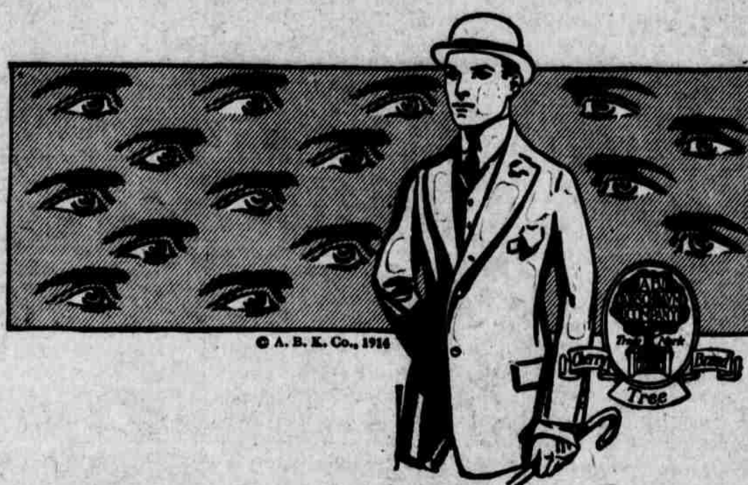
© A. B. K. Co., 1914

You had better get that suit. It's time. Those guns we give free with each suit are going to be gone some of these days. Come See These Clothes