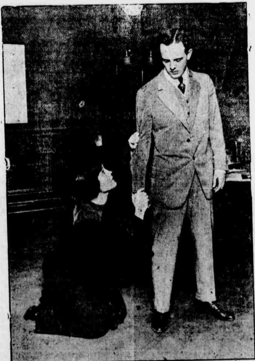
Scene in "The Traffic" Opera House, Saturday night, February 7

Buster Brown was in town Thursday, lecturing under the auspices of Hancock & Co. The public school gave the children an hour at noon, and every body turned out to see Buster Brown and Tige. He gave a long lecture on the qualities of the Buster Brown Shoes handled by Hancock & Co. Buster and Tige are always given a warm reception by the little folks, who turned out on force to see them. Buster was dressed like a boy and Tige wore a little red cap on his head, a blue ribbon on his neck and spectacles on his nose, and seemed to be in dead earnest about the shoe business.