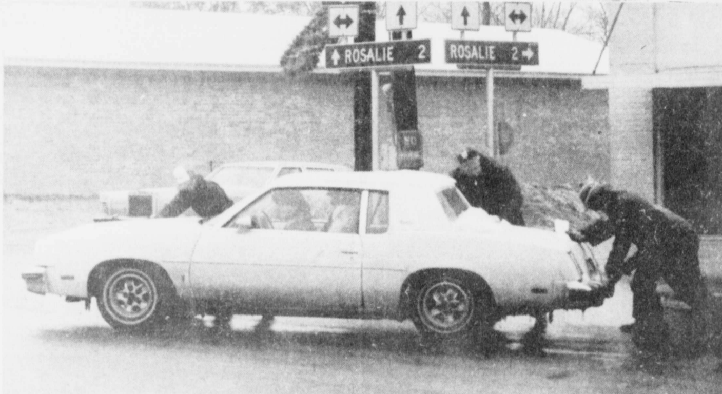
GETAWAY —Extra hands worked hard to help motorists perform

the simple maneuver of pulling away from the curb as glazed streets,