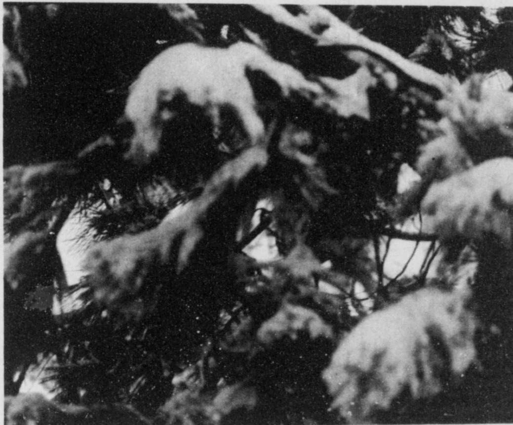
SNOWY BRANCHES —up to eight inches of snow fell last Friday leaving trees covered with pic-

This Salute Sponsored By BOGATA FUNERAL HOME