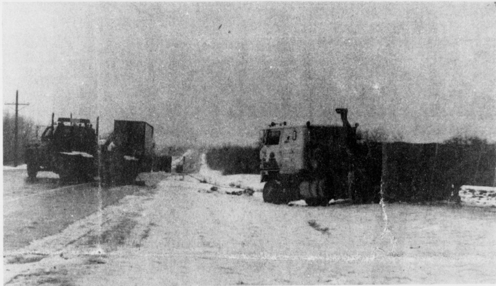
STRANDED —This eighteen wheeler loaded with pipe required the

For additional information, a free copy of IRS Publication 505, "Tax Withholding and Estimated Tax," can be ordered by calling the IRS number listed in the local telephone directory under U.S. Government.