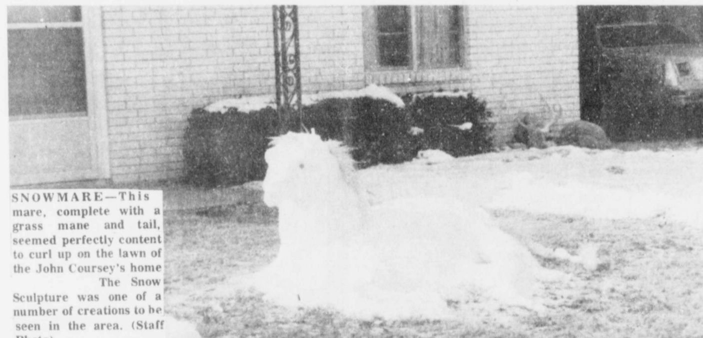
SNOWMARE —This mare, complete with a grass mane and tail, seemed perfectly content to curl up on the lawn of the John Coursey's home. The Snow Sculpture was one of a number of creations to be seen in the area. (Staff Photo)

and frustrating this past week. (Staff Photo)