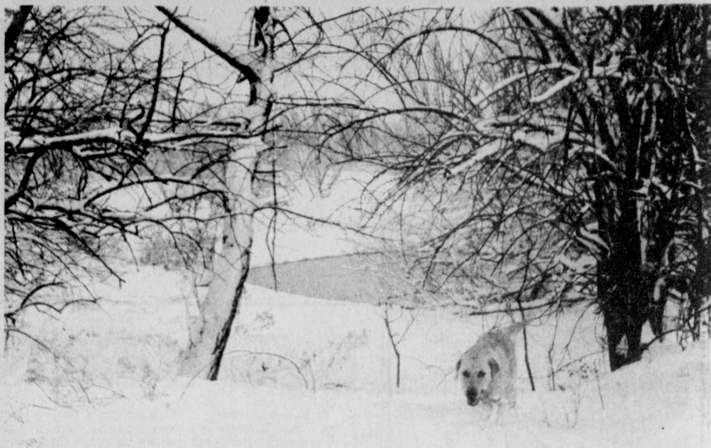
SNOWY FUN for dogs, kids and the young at heart was provided by last week's snowfall which seems to have put everyone in the Christmas spirit.