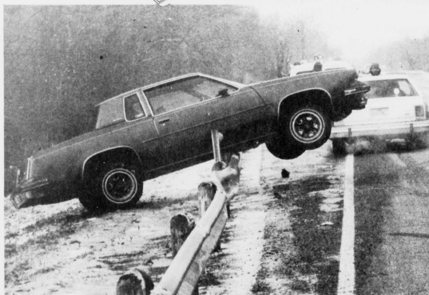
UP IN THE AIR over ice seemed to be the situation as their 1983

Don't delay, take advantage of this extended sale if you haven't already!