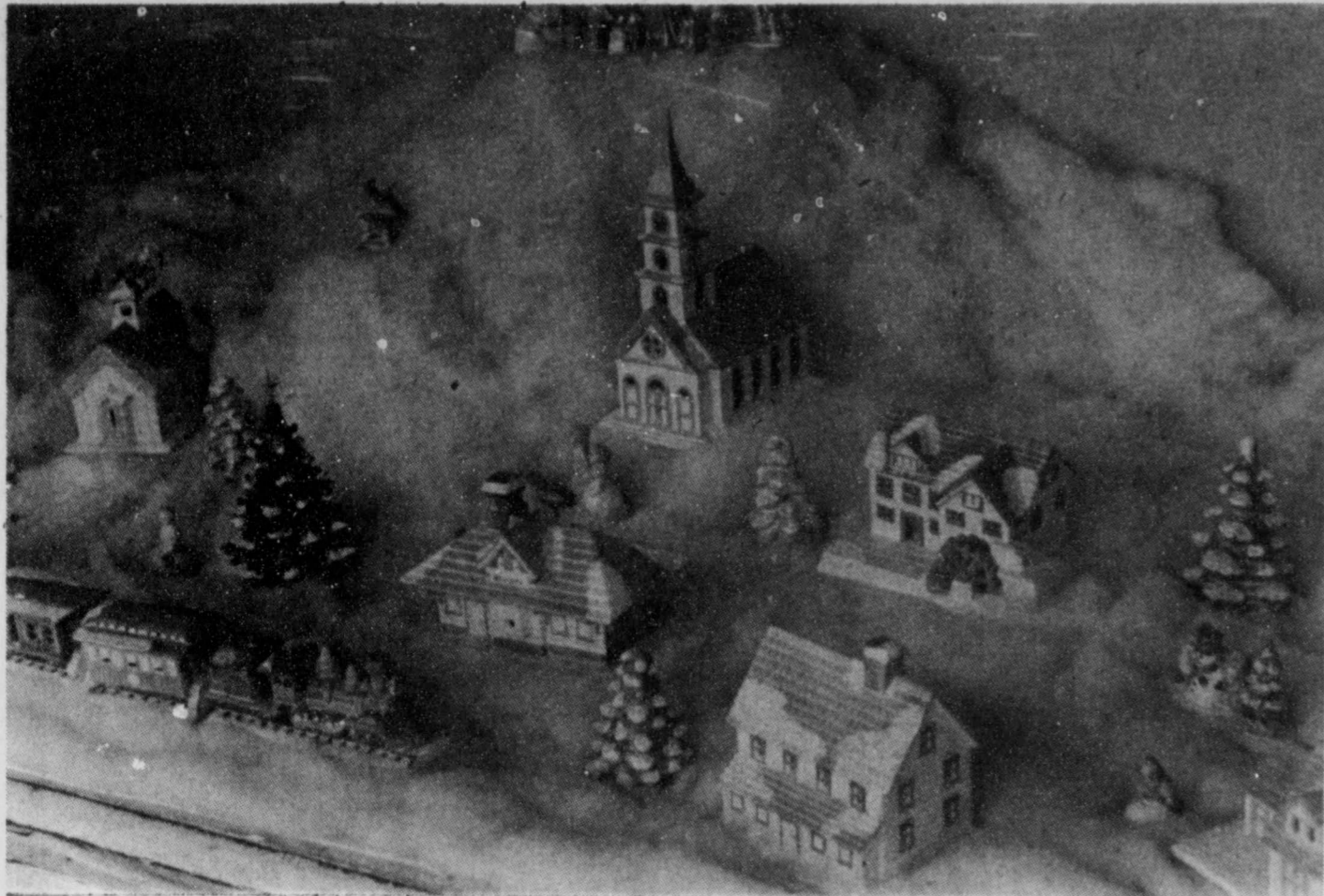
VILLAGE SCENE —This lovely snowy scene is in the window of House of Flowers in Bogata, and was created by Mary Ellen Kain. The ceramic

scene is complete with a depot, skates, trees and all the village stores.