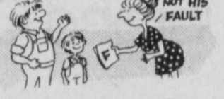
Pa: How did Joey do on his history exam? Ma: Not too well, but it wasn't his fault. They asked him things that happened before he was even born.