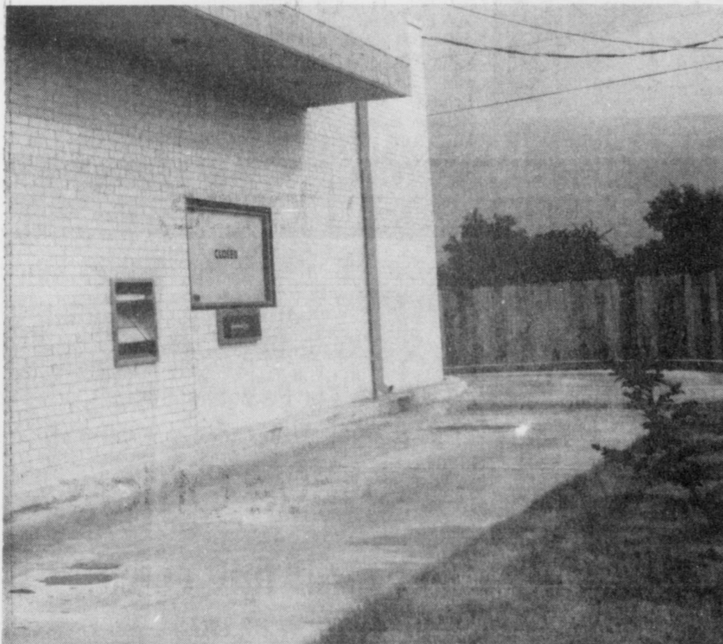
THE NEWEST feature of the Talco State Bank is the drive-through bank window. Tellers Nelda Carroll and Stacie Hinton serve customers through the drive-up window.