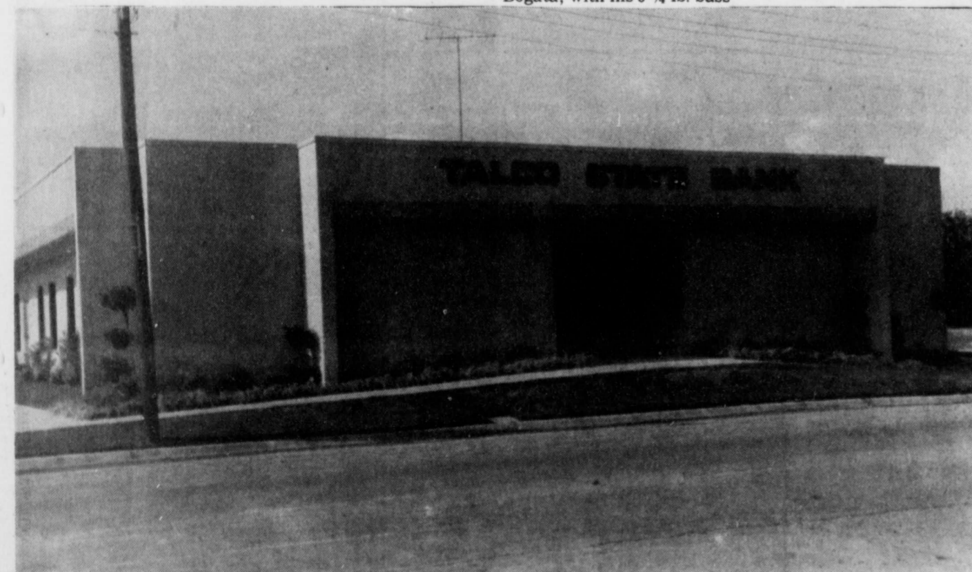
NEW BUILDING—The Talco State Bank has moved one block east into its new home, a 5,000 square foot building with many added banking features.