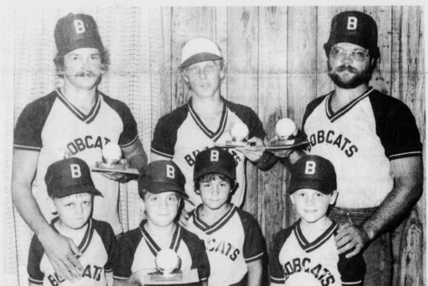
RETURNING BOBCATS—The 7-year old players presented their coaches with trophies