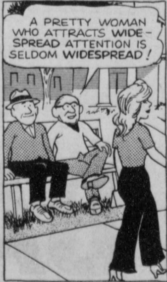
have a nice weekend...