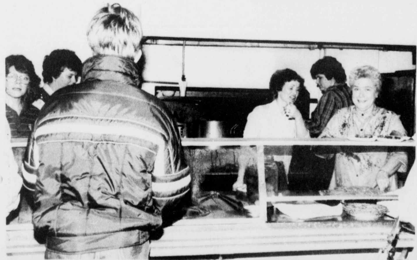
THEY CAME, THEY ATE and then approximately 600 stayed for the variety show

$7.50 A Year For Red River, Lamar and Titus Counties $16.00 A Year For Out of Above Counties And In State of Texas $12.50 A Year For Out of State DEADLINE For News and Advertising Tuesday At Noon