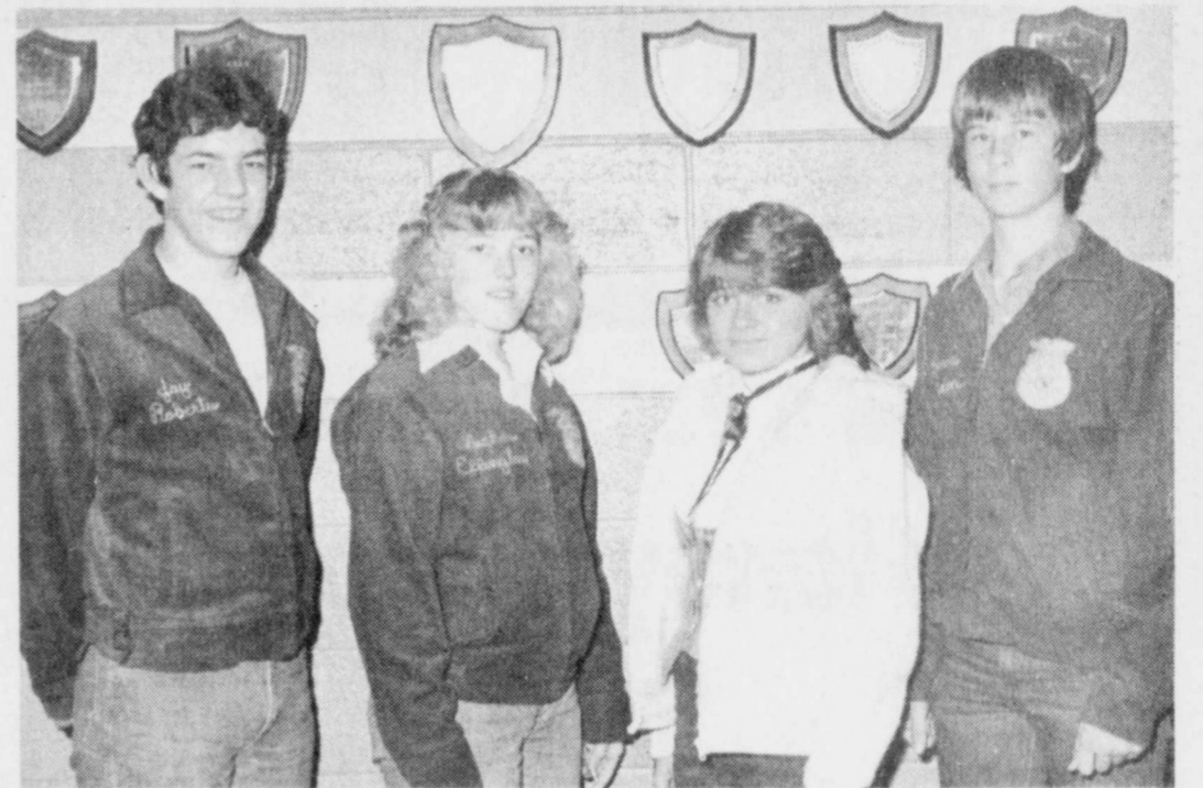
FOURTH PLACE in the Quiz contest at the Paris District FFA Leadership Contests in Mt. Vernon

First and second place teams on the district level proceed to contests on the Area VI level. The area contests will be conducted on the campus of East Texas State University in Commerce Tuesday, Nov. 30.