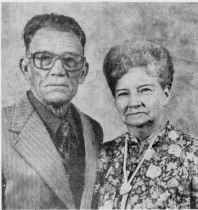
Smiths Celebrate 50th Anniversary

Beggar: Can you help a poor man. I need bread. Professor: Explain that a little better. Do you need bread or knead bread? I mean are you a beggar that loafs or a loafer that begs?