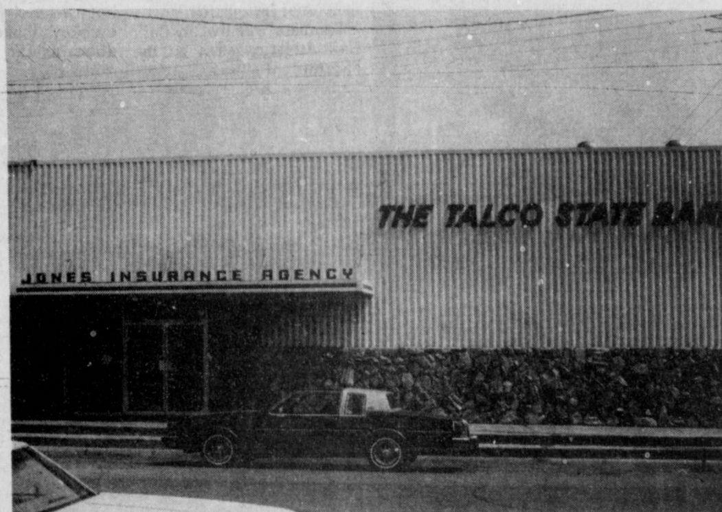
TALCO STATE Bank located on Main Street in Talco, provides one stop banking services. NOW Accounts, direct deposit, friendly faces, Talco State Bank can help with personal or business banking needs.

• Fresh Meat Market • Frozen Foods • Large Selection Of Canned Goods • Fresh Produce Friendly Local People Providing Convenience and Fast Service