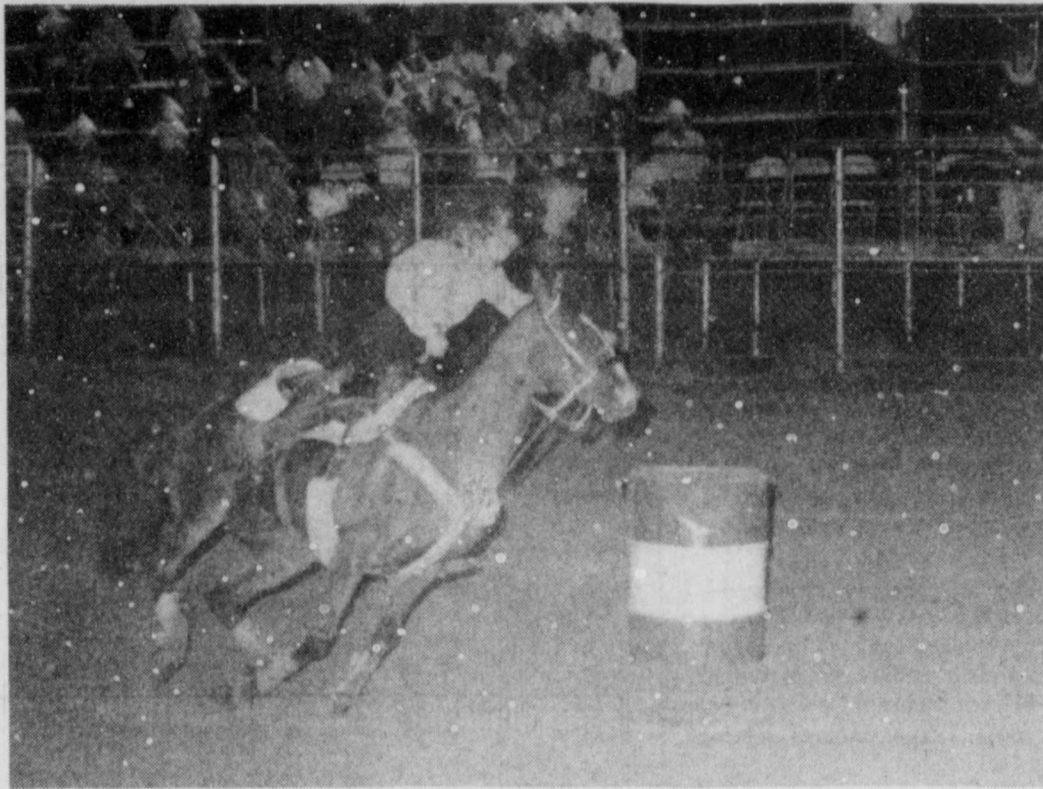
BARREL RACING at the Bogata rodeo was of excellent quality. One of the many competitors at the rodeo swings a little wide as she prepares to thunder down the home stretch.