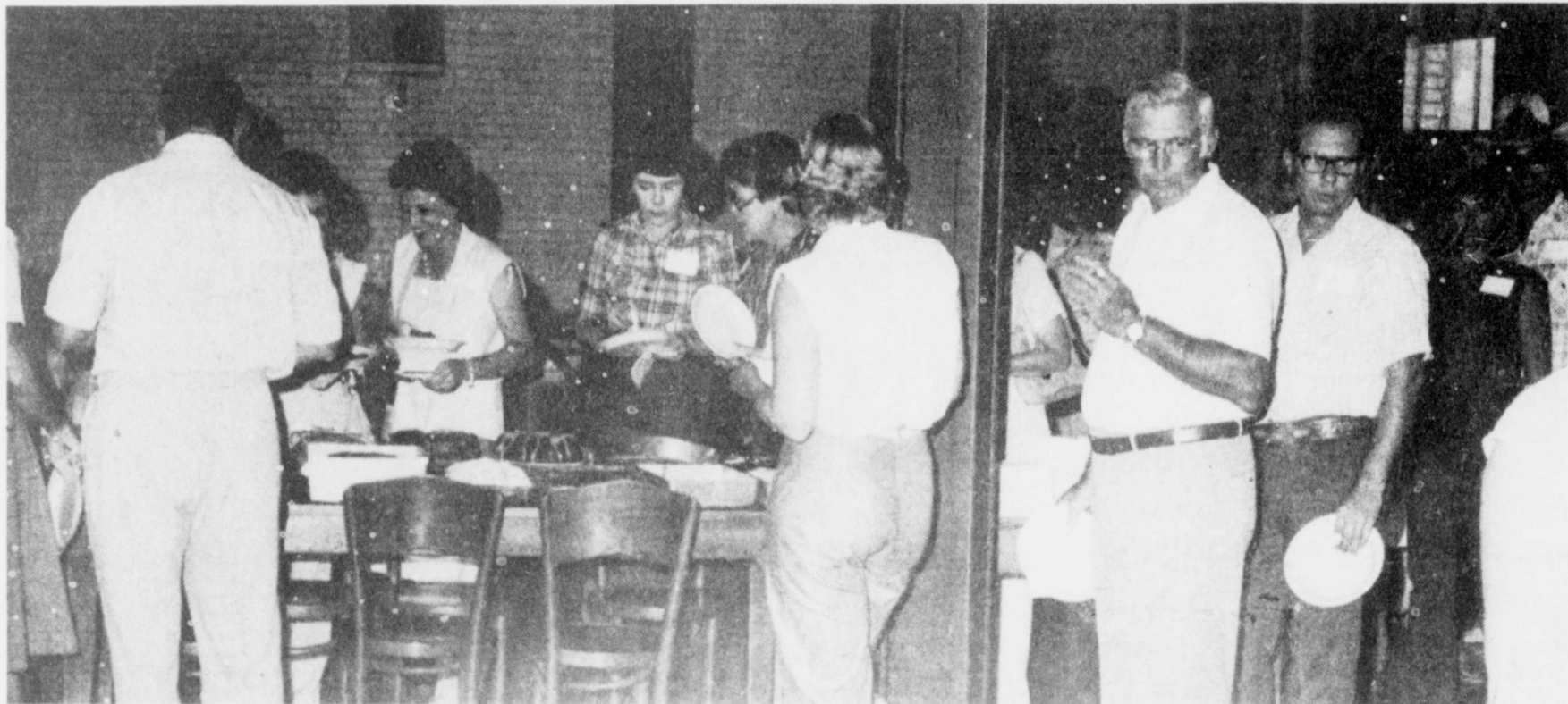
REUNION-graduates of Talco High School visited, showed pictures and themselves with the school and one another at the first Talco High School Reunion held recently.