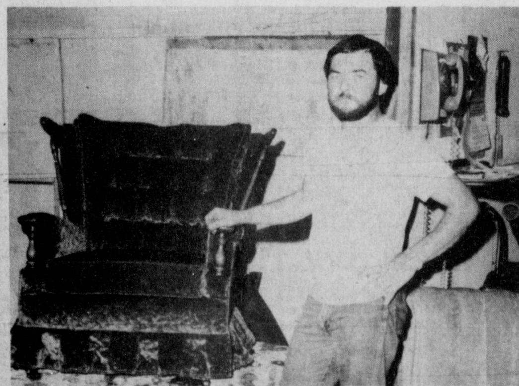
SPEIR & SPEIR Upholstery in Bogata offers the finest in fabric and profession recovering. They can make an old chair look like new, with whatever style, pattern or texture fabric a customer might choose.