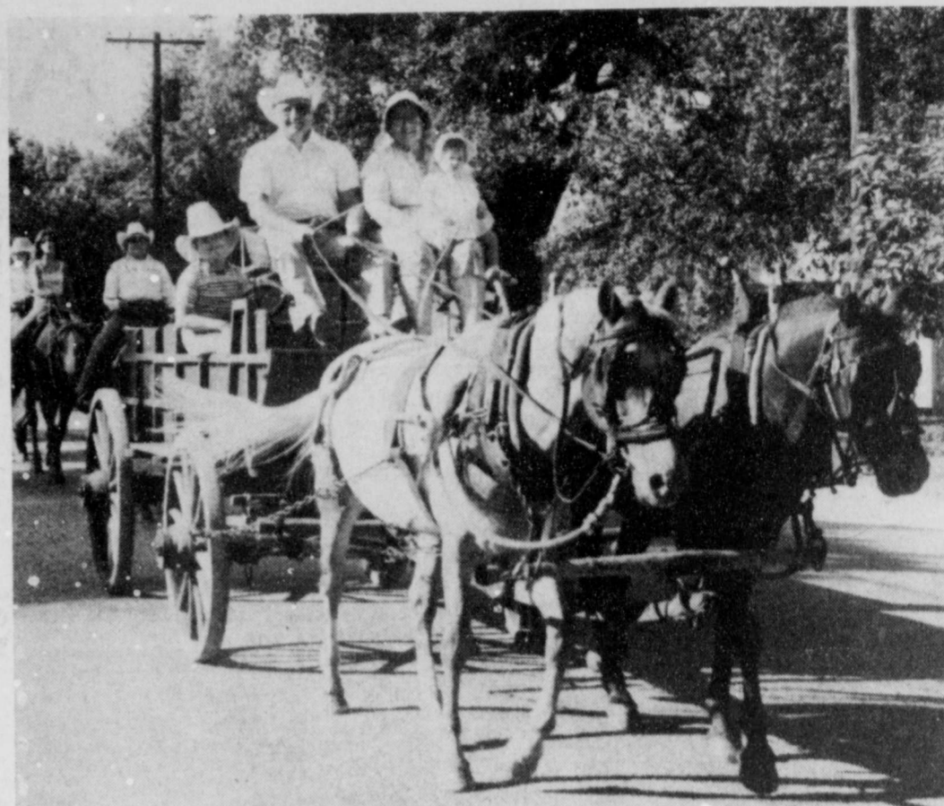
SHADES OF THE old West-the Clarksville Wagonmasters were present at the Bogata Frontier Days parade with a buckboard and old fashioned dress for all.