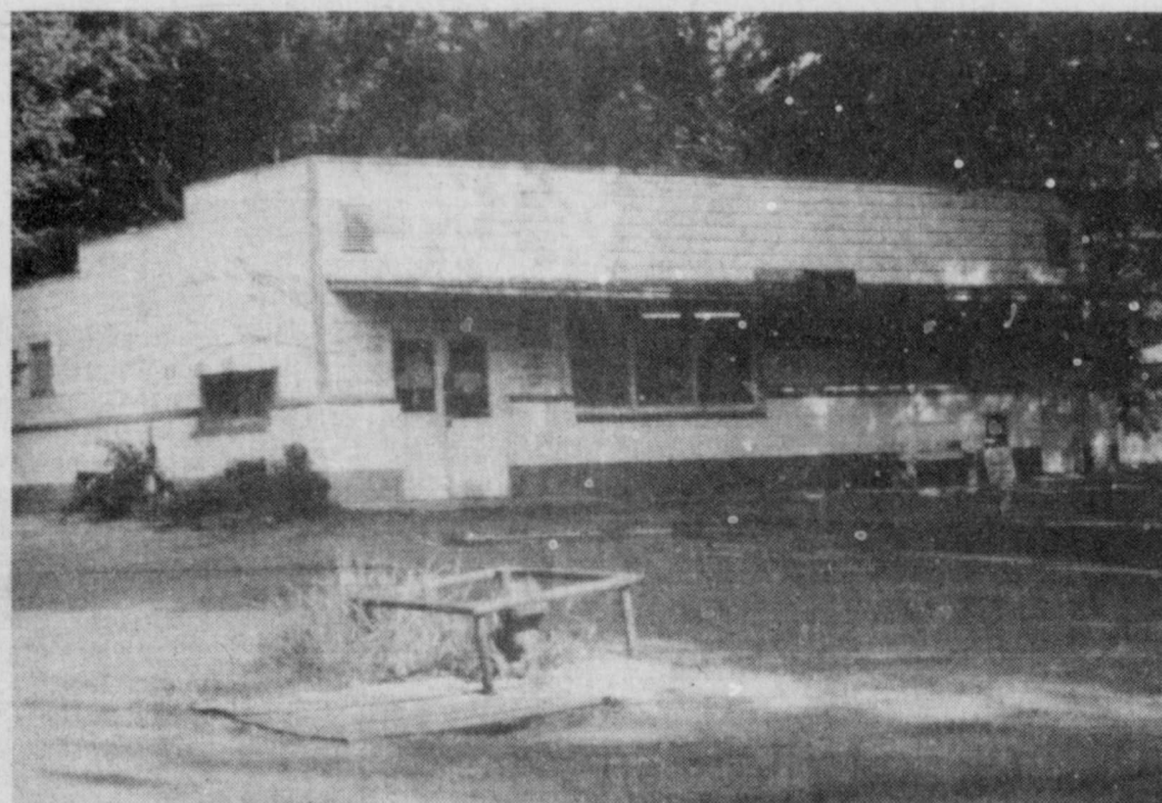
ROLLINS Grocery, located across from Deport Elementary School, has the finest in groceries, sandwiches or candy. They will greet a customer with a friendly smile and try to help in any way possible.