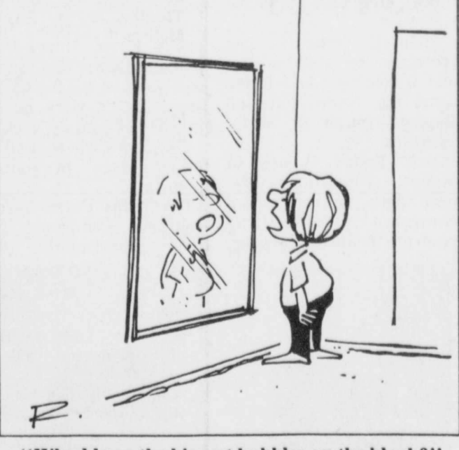
"Who blows the biggest bubbles on the block?"