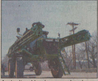
Agricultural businesses showing their products at the Ag Day.