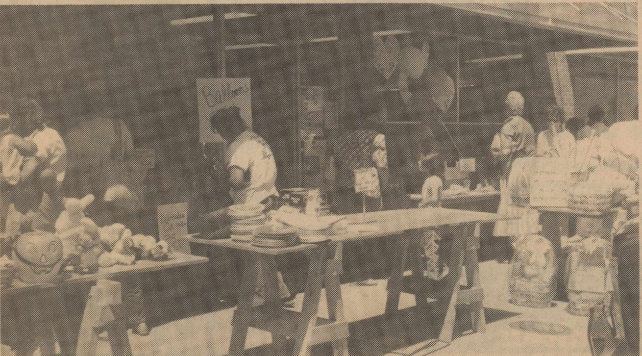
The Sidewalk Sale was a big success again this year with lots of money saving bargains.