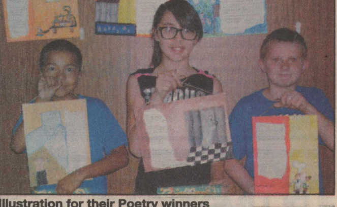
Illustration for their Poetry winners 3rd Grade