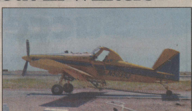
The crop duster was safely landed at Winters Airport after the incident.

After the crash the pilot was able to fly the plane