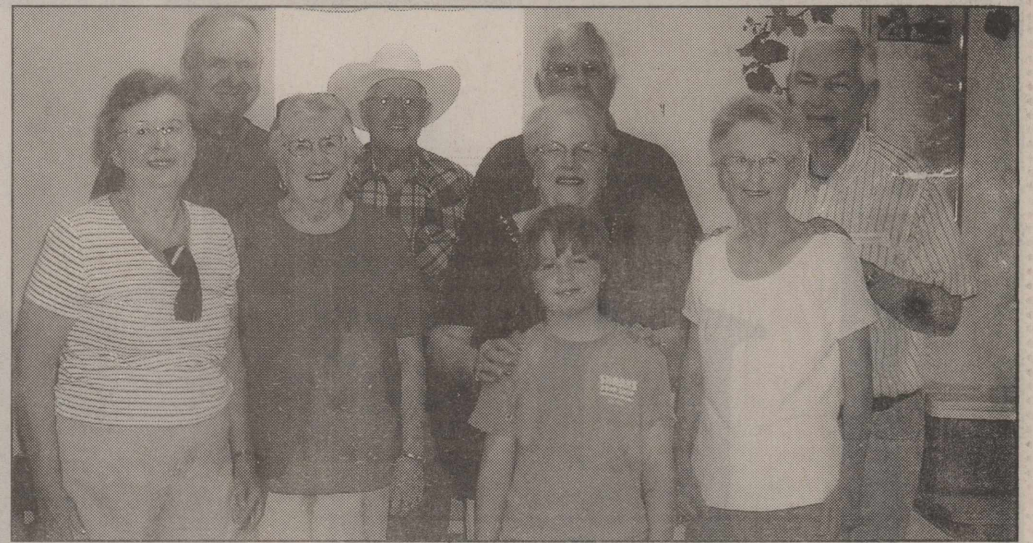
ABOVE: Volunteers helping Meals on Wheels from the First Baptist Church. LEFT: Volunteers helping Meals on Wheels from the First Methodist Church.