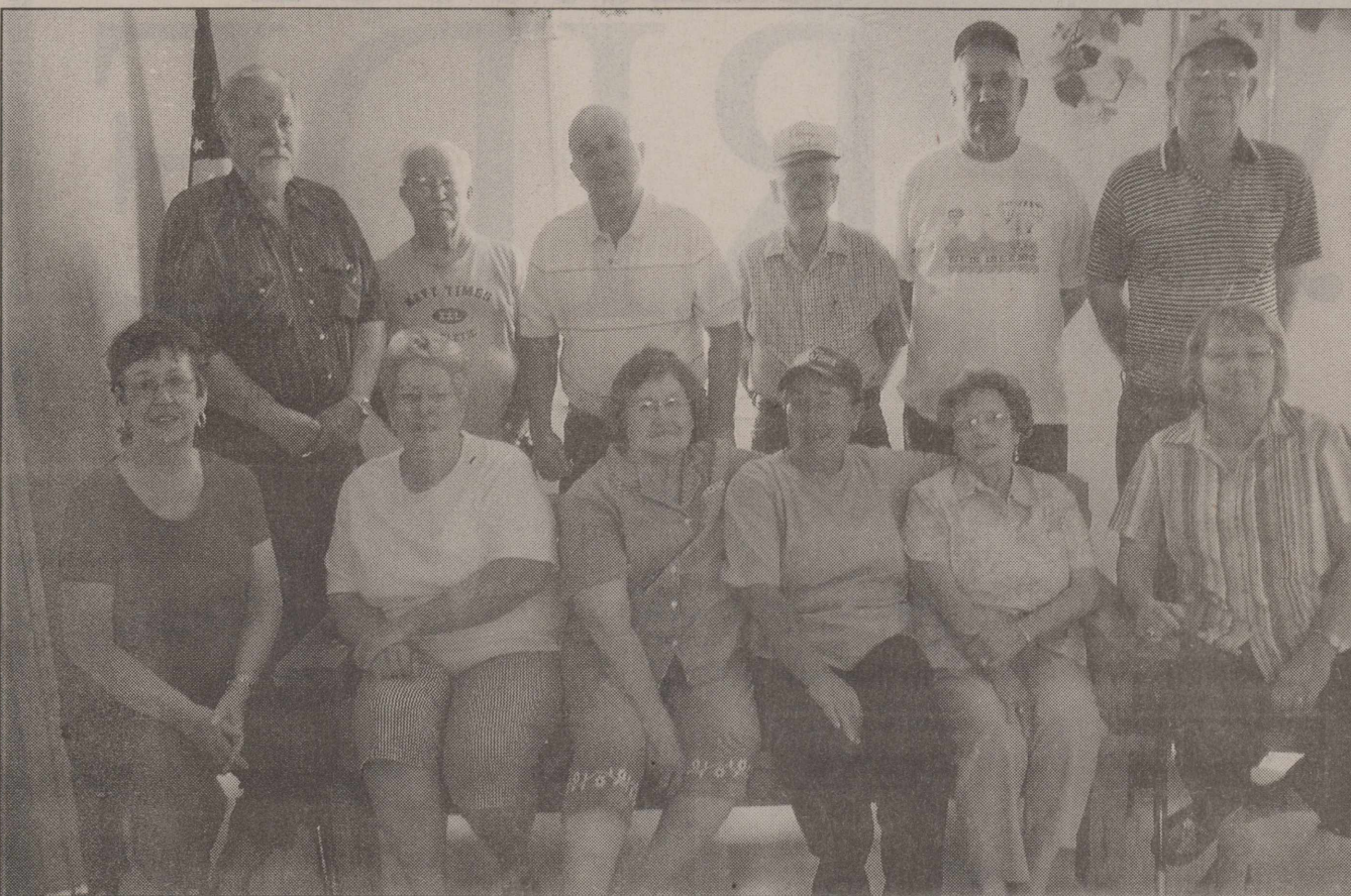
ABOVE: Volunteers helping Meals on Wheels from the Church of Christ. BELOW: Volunteers helping Meals on Wheels from the Wingate Baptist Church and Eastern Stars. RIGHT: Volunteers helping Meals on Wheels from the Mt. Carmel Catholic Church.