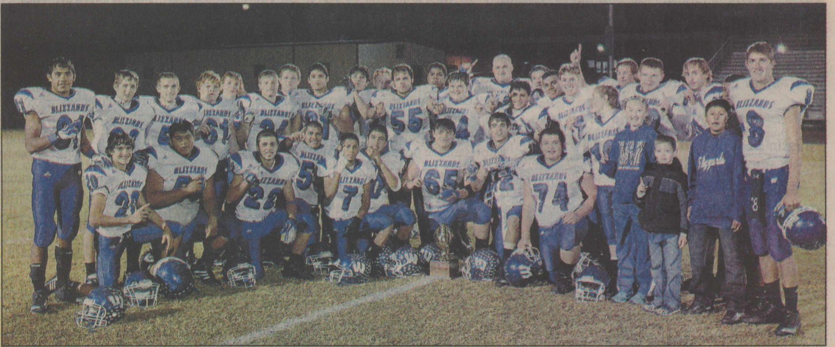
The Blizzards didn't hesitate a bit to get into the next round of the playoffs. Winters will be facing the Ben Bolt Badgers at Llano on Saturday November 19 at 6 p.m.

The final minutes of the game would produce no points and send the Blizzards into the next round of the playoffs at the same place, Llano, at 6 p.m. on Saturday the November 19 against Ben Bolt.