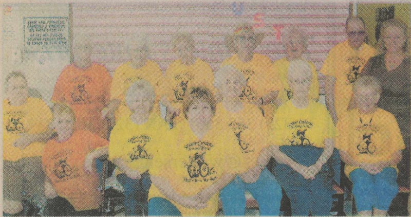
Senior Citizens Olympics

located at 101 Bluebonnet and phone is (325) 754 3331.