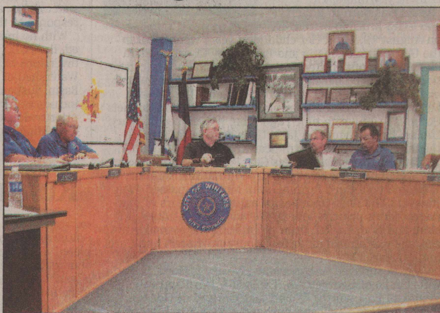
Winters City Council