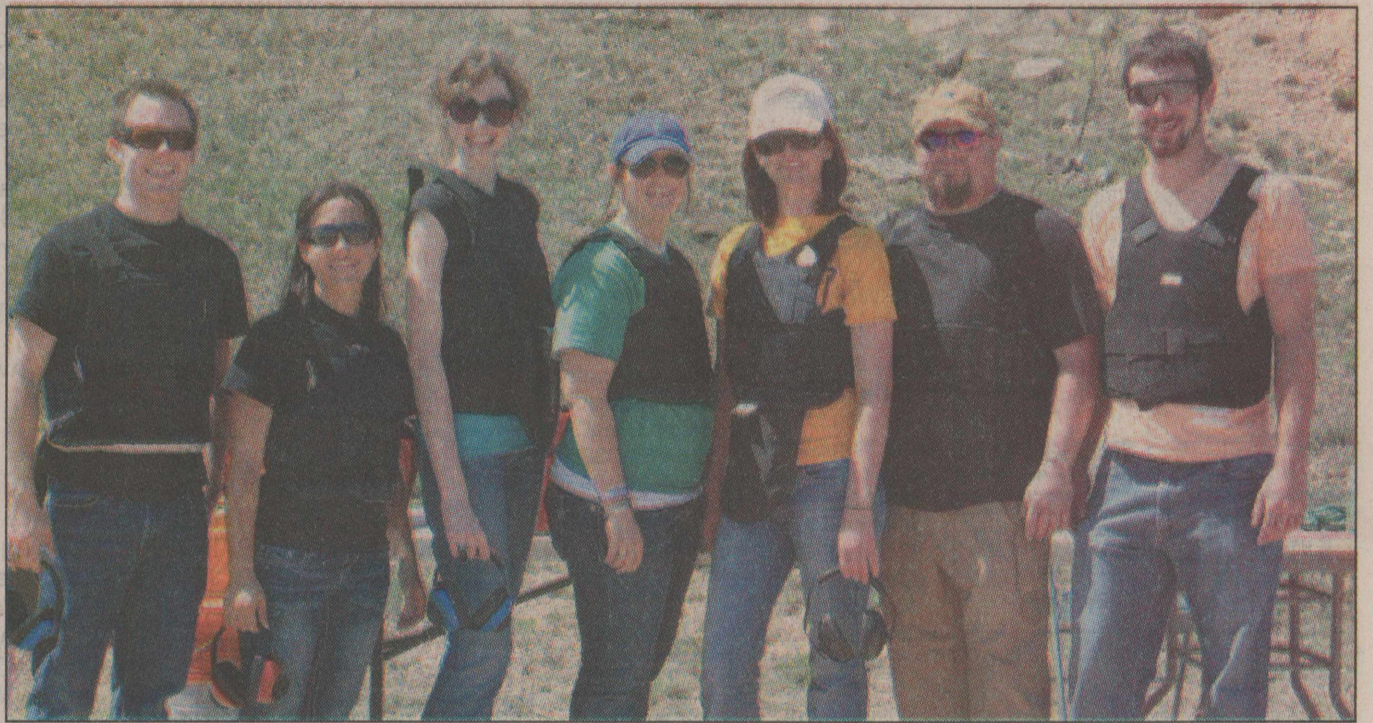
Criminal Justice students from Hardin-Simmons University, in Abilene, came to Winters last week to spend some time with law enforcement officials.