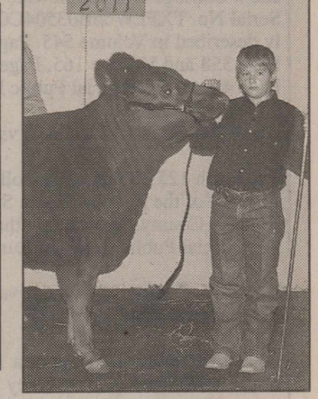
Keith Fields Reserve Heifer