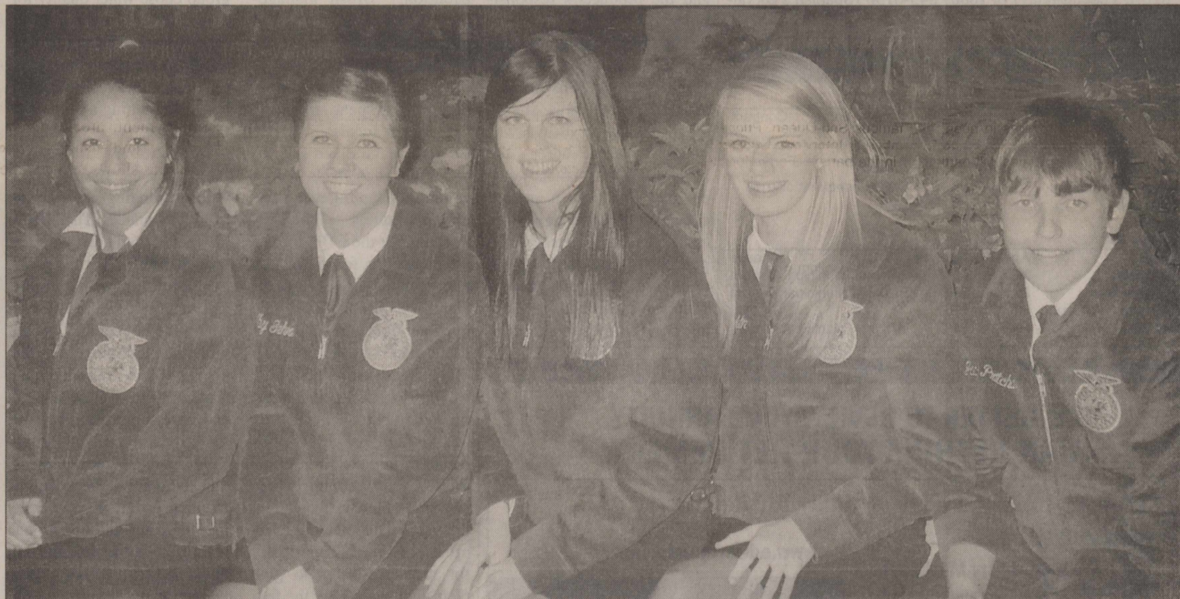
WINTERS STUDENTS competed in the Big Country District FFA Leadership Development Contests.