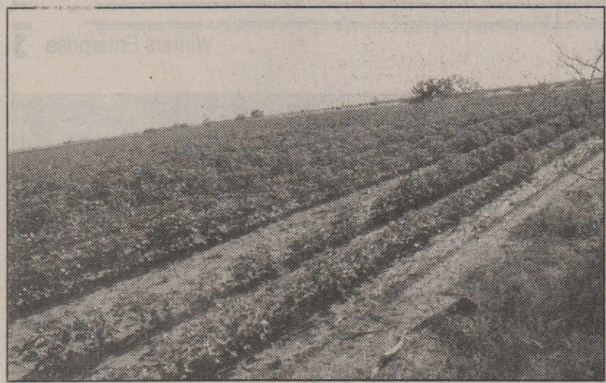
QUALIFIED FARMERS could receive $50,000 to settle claims of racial bias.