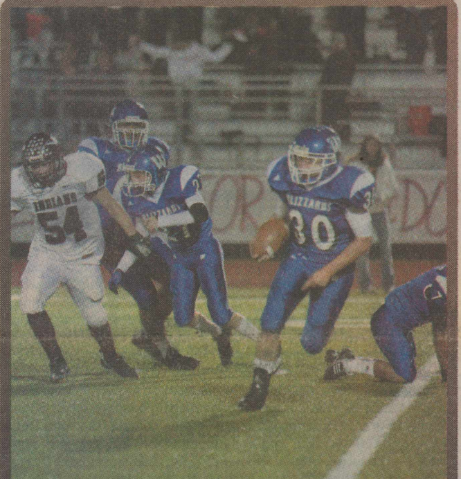
Season is over The Winters Blizzards ended last Friday a great 2010 season in Marble Falls, after being defeated by Ganado in the playoffs.