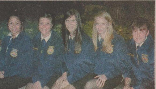
FFA's to state meet