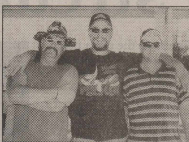
The Literary and Service Club of Winters will be sponsoring this week the Homecoming Turkey Dinner.

The General Federal of Women's Clubs pushed for the passage of Pure Food and Drug Act. In 1910 the GFWC supported the legislation of the 8-