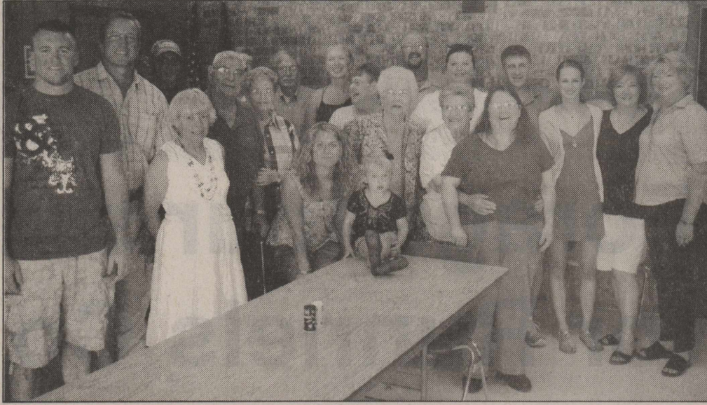
FOLLOWING A TRADITION started in 1923, the Davis and Nichols families held their 87th annual reunion.