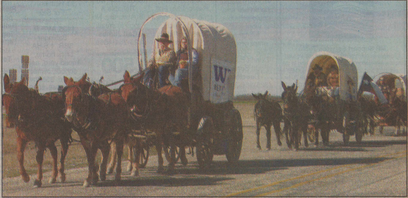
The Santa Fe Trail riders were in Winters on Feb. 15 and 16 and attended a stew dinner and a dance at the Rock Hotel. WACC and the Red Hat Ladies send a special thanks to Desperate Measures for their donation of time and talent.