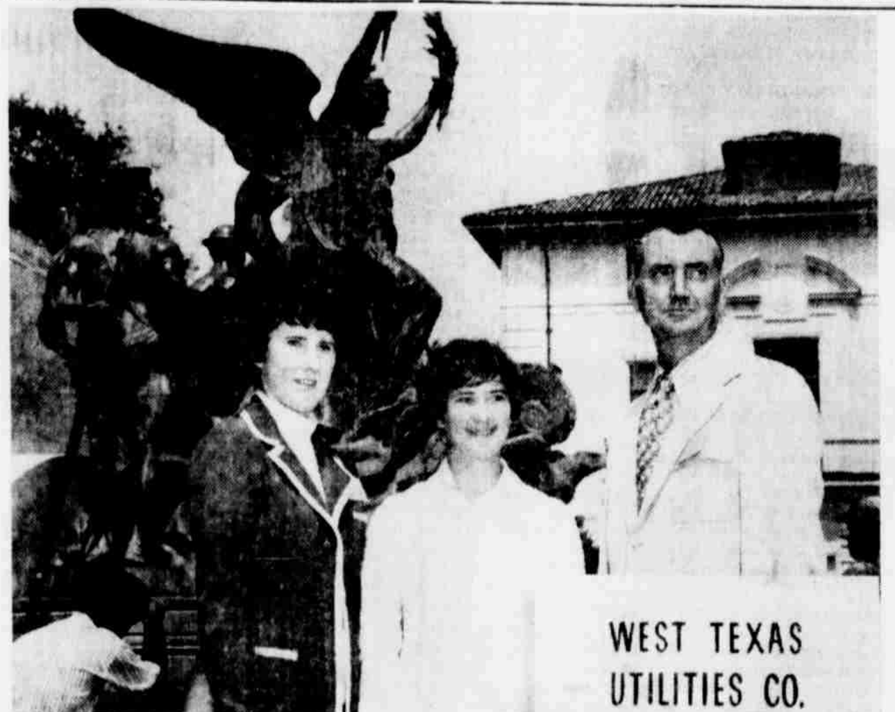
WEST TEXAS UTILITIES CO.