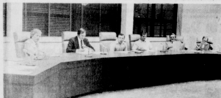
KNIGHTS OF THE ROUND TABLE? No, just Abernathy School Board members in the new board room of the Administration Building. Each board member is equipped with his own microphone.

The first remodeling bids were accepted in May and work began on a new administration building.