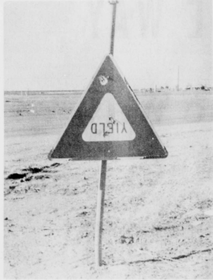
Pranksters' Maybe, but with the high winds we have in this area it would be hard to tell. This sign was found just south of New Deal.