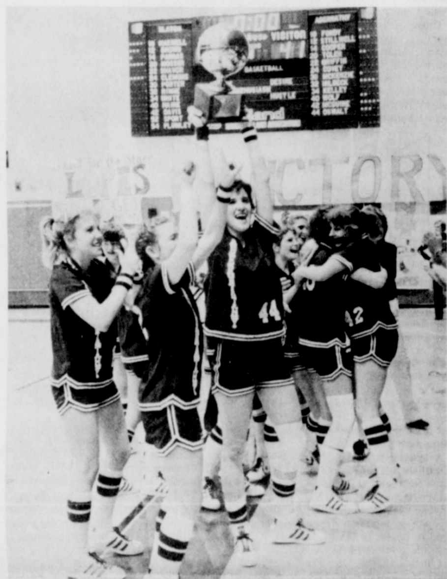
VICTORY! HOW SWEET IT IS is reflected in the faces of these Lady Lope players after Monday nights game