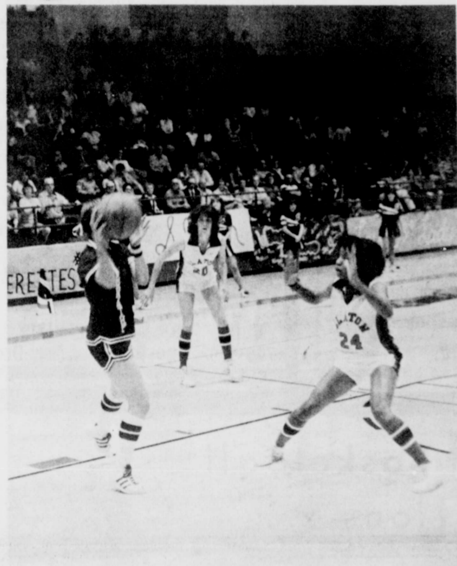
ACTION AGAINST SLATON, the Lady Lopes won 41-40.