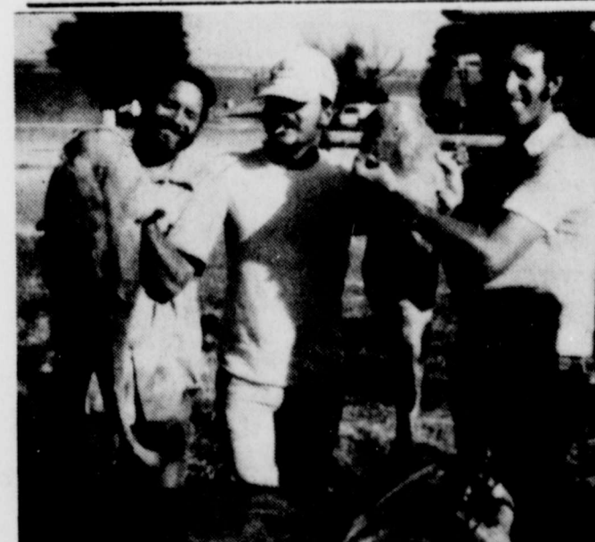
Here are to big ones that DID NOT get away. Displaying 20-pound and 30-pound yellow catfish which

There is a State Law which prohibits burning of any kind in the City Limits, and is administered by the Air Control Board. Due to the drought that everyone is experiencing at this time, each and every citizen of Abernathy should take extra precaution with anything such as cigarettes, matches, or anything else that could possibly endanger property or more importantly --endanger human lives.